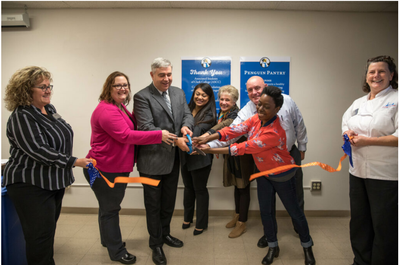
Grand Opening 2017 Science Buliding

“The Penguin Pantry was created to address student hunger at Clark,” said Gruhler. “The goal is to provide support for students’ basic needs and serve as a bridge to campus and community resources. We want students to persist to graduation and goal completion – and know the pantry can help with this.”