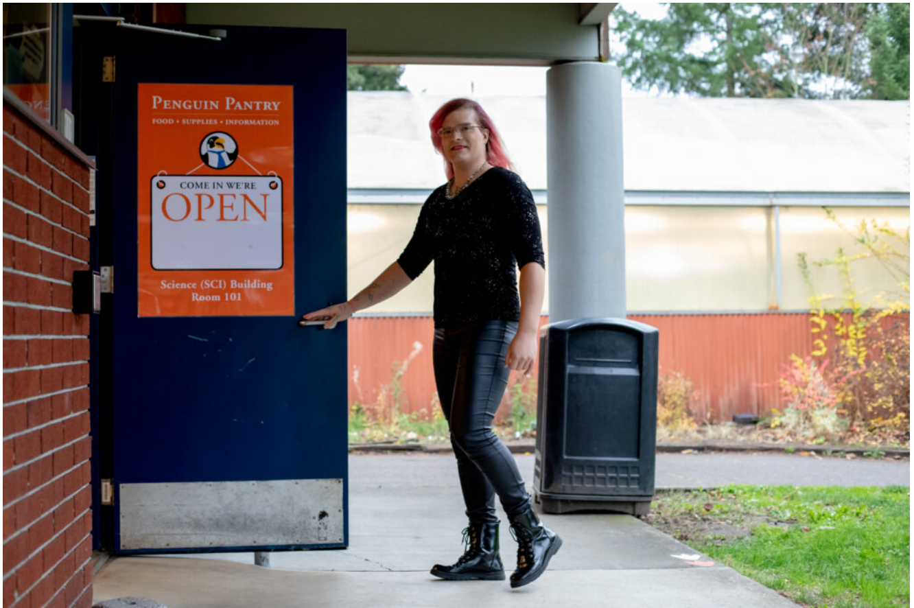
First Anniversary 2018