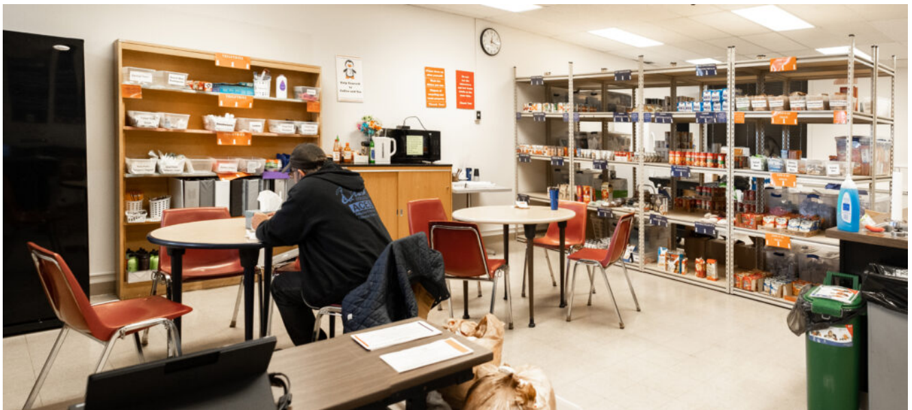
First Anniversary 2018