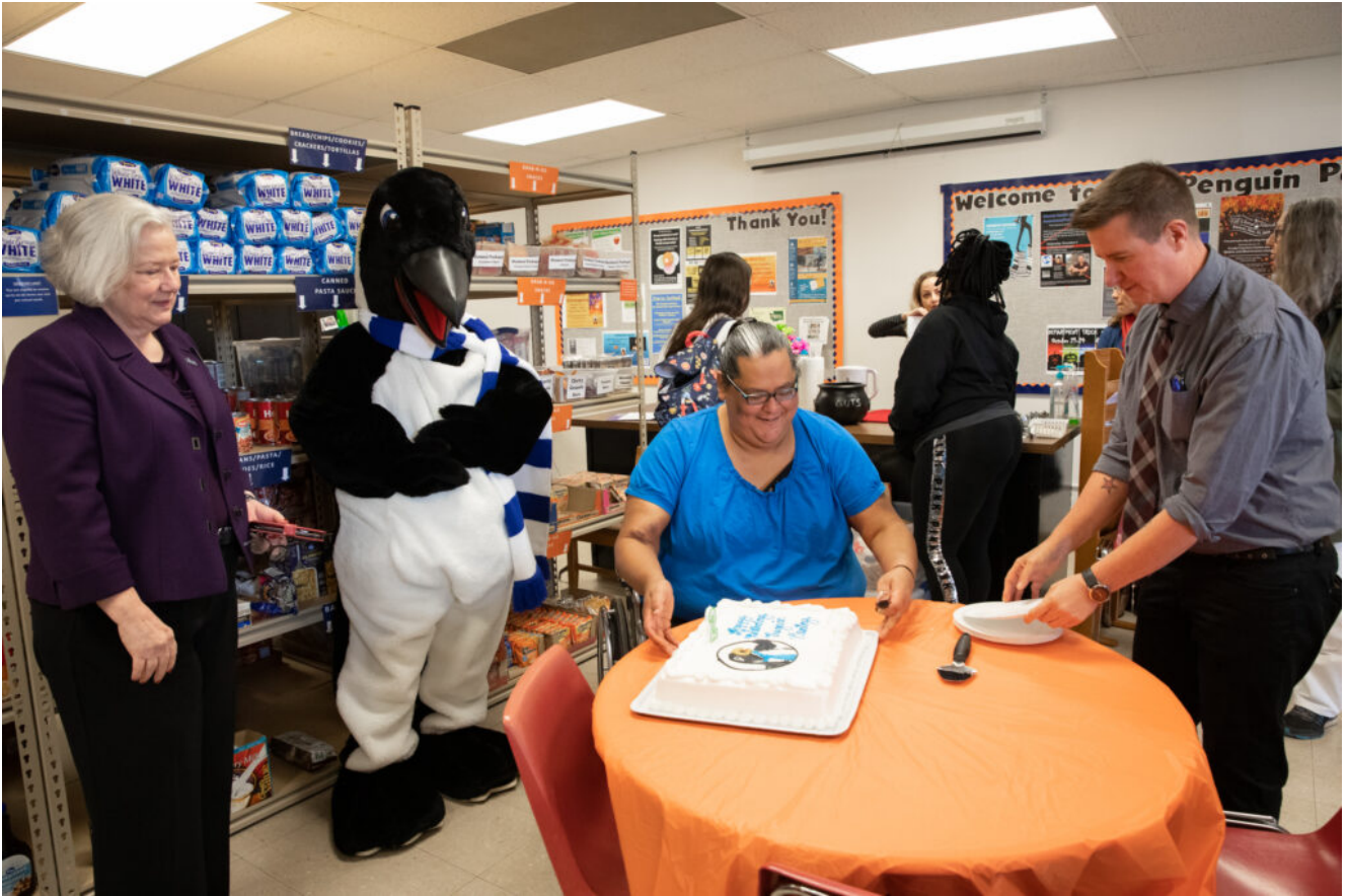
Second Anniversary 2019