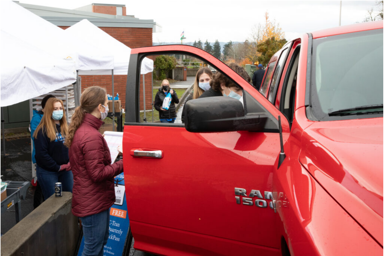
Car Pick-ups start 2020