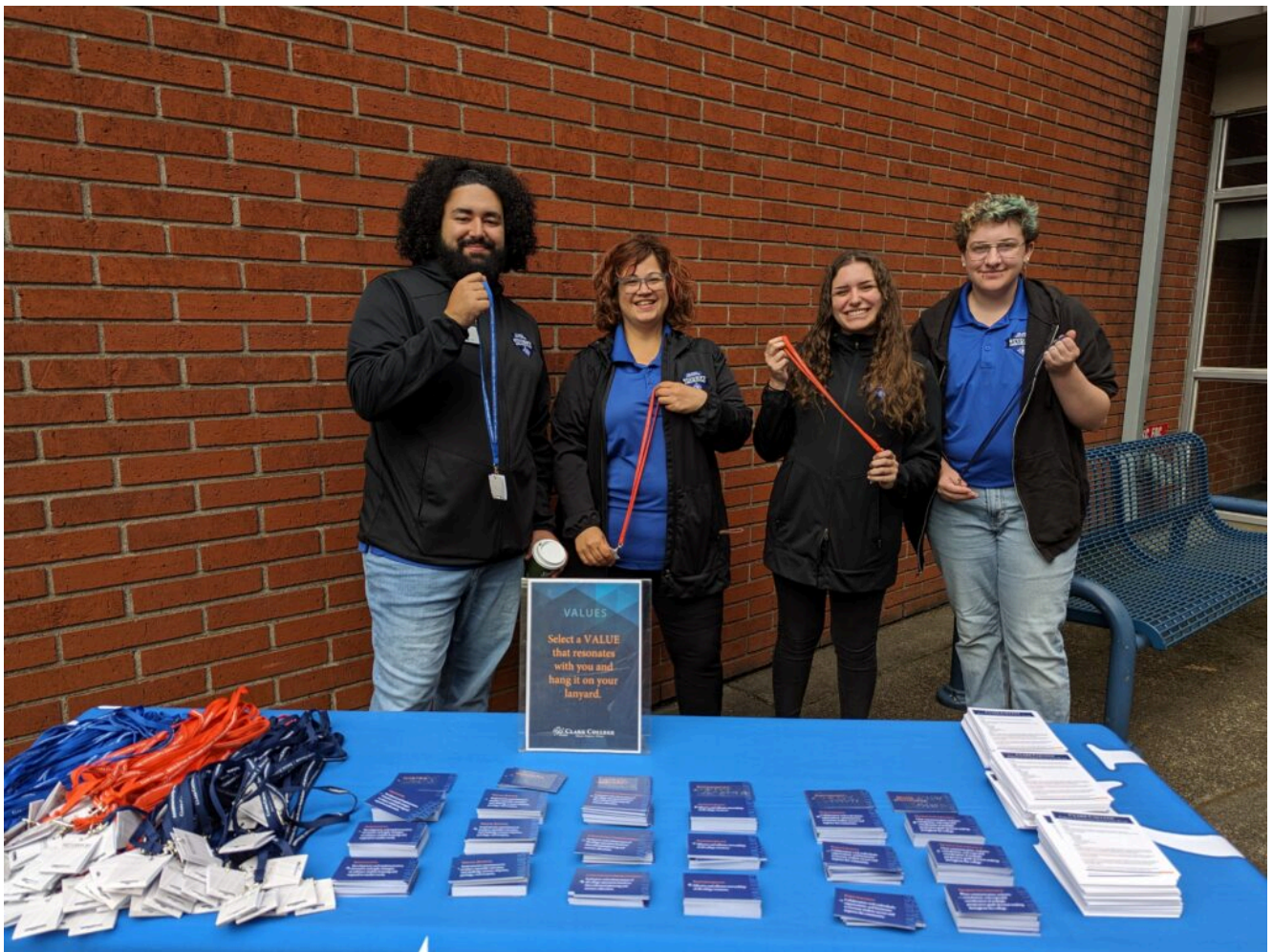
Student Ambassadors distributed college lanyards and values outside.

Before staff entered O'Connell, they could stop by a Clark College Values table staffed by Student Ambassadors. They chose which of the values from the Strategic Plan they would like to focus on in their work this year, then attached the value card to a Clark lanyard. The six values are Social Justice, Partnerships, Innovation, Shared Governance, Continuous Improvement and Sustainability. Staff also could pick up a laminated pocket-sized Strategic Plan.