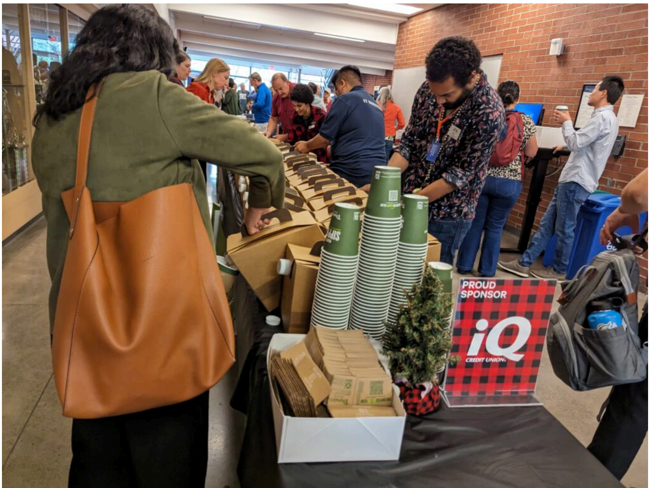
IQ Credit Union provided sustenance.