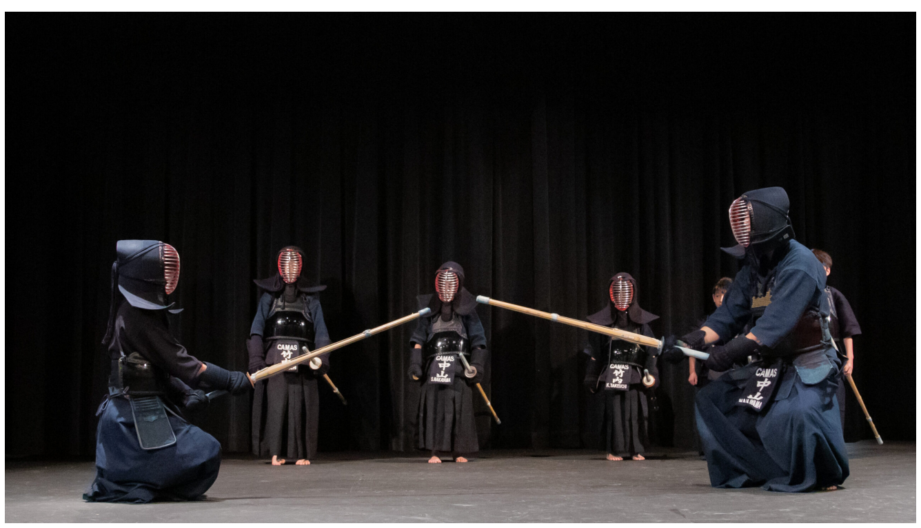
Kendo Dojo demonstration at the 2023 Sakura Festival.