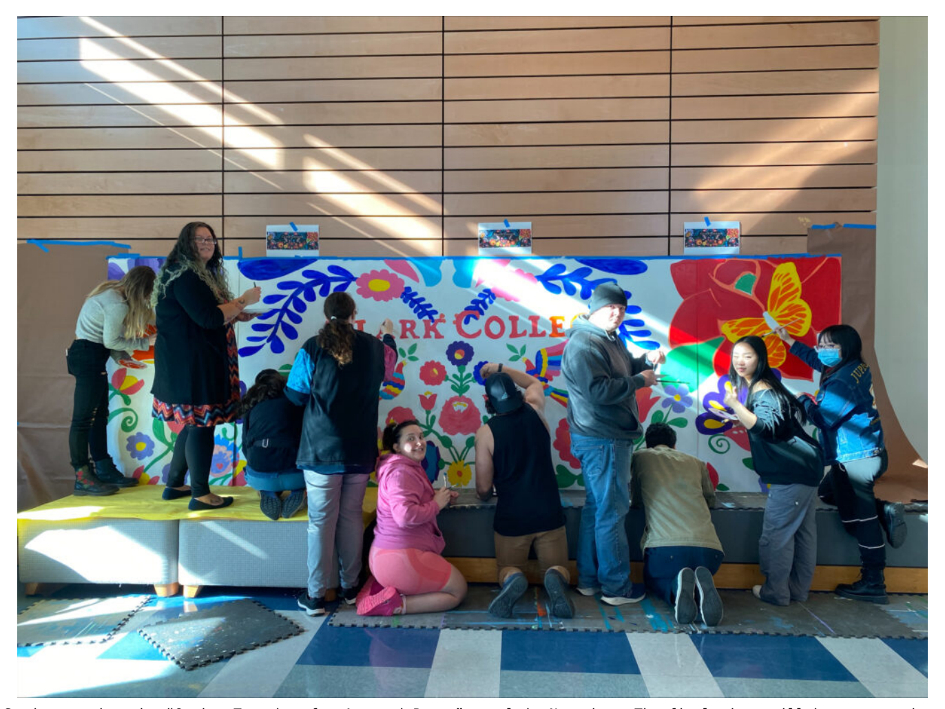
Students paint the "Coming Together for Art and Peace" mural in November. The final piece will be presented at International Day.