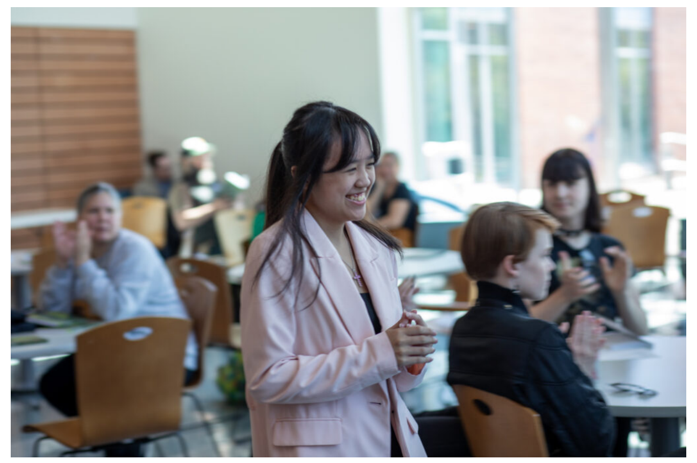
The event had a very supportive and attentive crowd for the newly published authors.

The Swift's contributing writers and poets are Clark students and alumni. This edition features the work of 23 writers and includes 10 poems, 10 works of short fiction, and 6 works of short nonfiction. The annual journal was edited by first-time student editors.