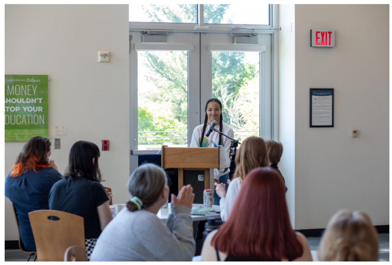
For many authors, this was their first time reading their work publically.

The Clark College community celebrated the annual publication of The Swift , the college's student-run literary journal at a release party that included student readings, coffee and pastries, and stacks of the 2024 issue on May 9 in PUB 161.