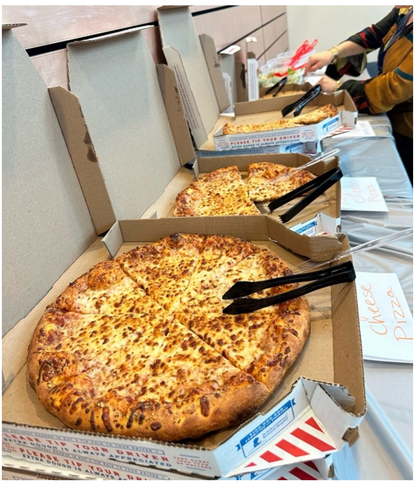
Free pizza, salad, and drinks were provided, as well as free career clothing for students.