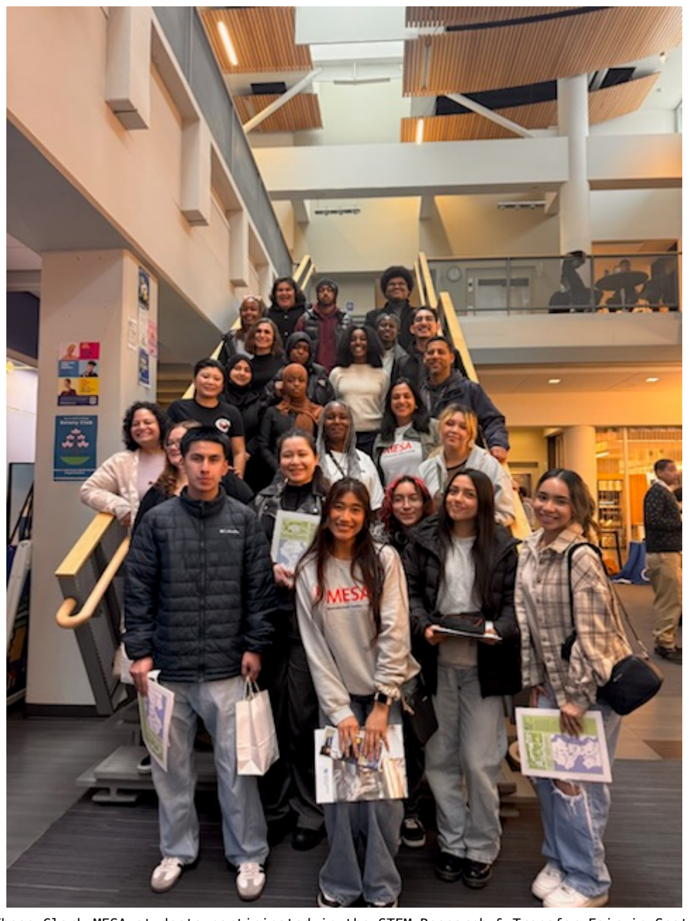
These Clark MESA students participated in the STEM Research & Transfer Fair in Seattle on November 14.

No ve mber 14 : ST EM Re s e ar c h & Tran s f er Fa ir Se at τl e