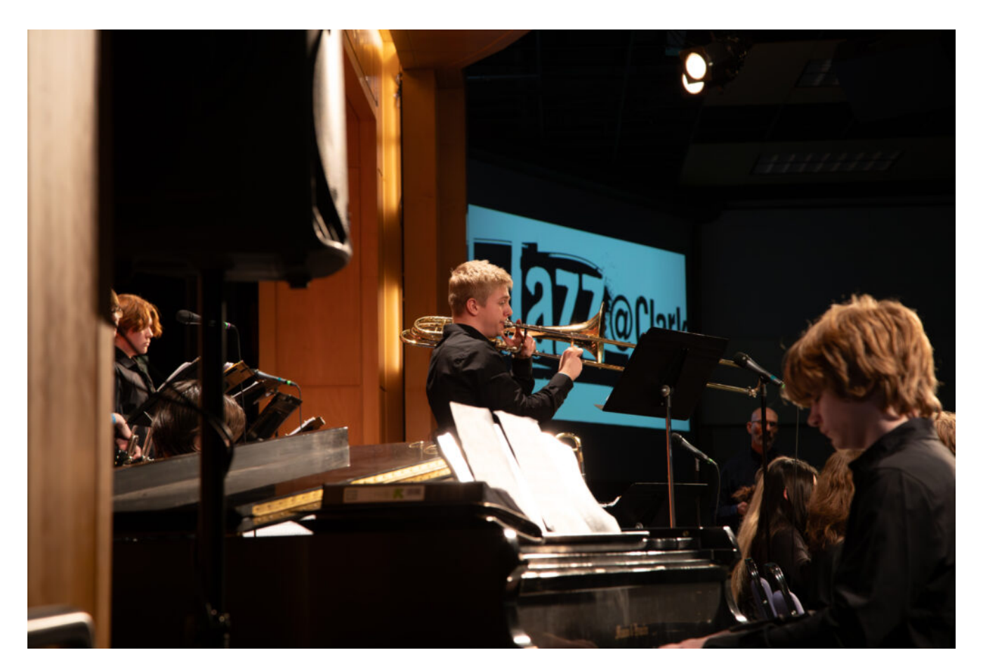
Highlights from Thursday's performances.

The jazz bands represented middle schools and high schools from a large region. Although many of the student musicians live in Clark County or the Portland metro area, many came from much further away —from as far north as Port Angeles, Washington, as far east as Yakima, and as far south as San Jose, California. Here is an overview of the participating jazz bands: