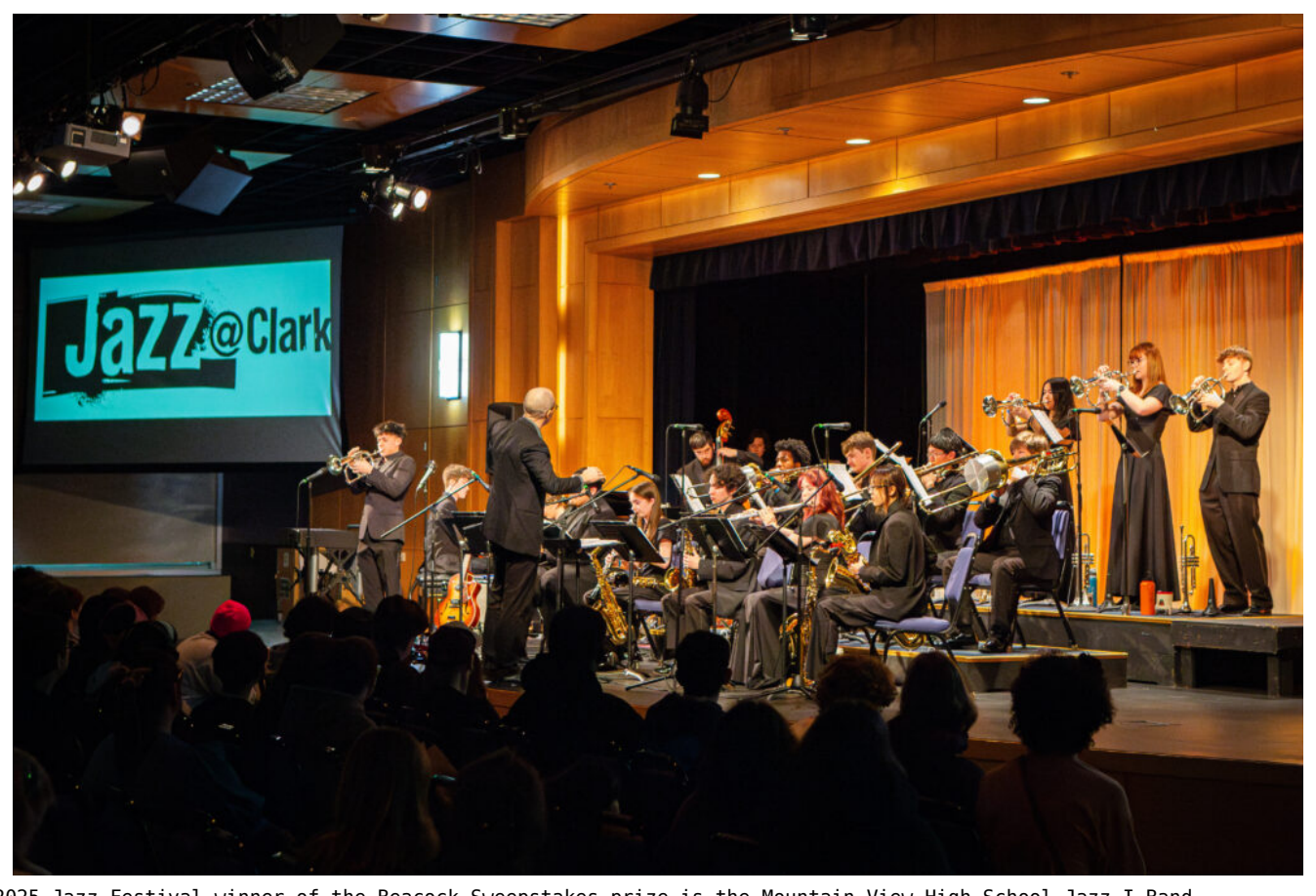
2025 Jazz Festival winner of the Beacock Sweepstakes prize is the Mountain View High School Jazz I Band.

The Clark College 61^{\rm st} Annual Jazz Festival is in the books! Thanks to the student musicians, band directors, chaperons, family, and community members who attended the 61^{\text{st}} Annual Clark College Jazz Festival from January 30 through February 1. Nearly 60 middle school and high school jazz bands performed for an appreciative audience at the world-class jazz festival.