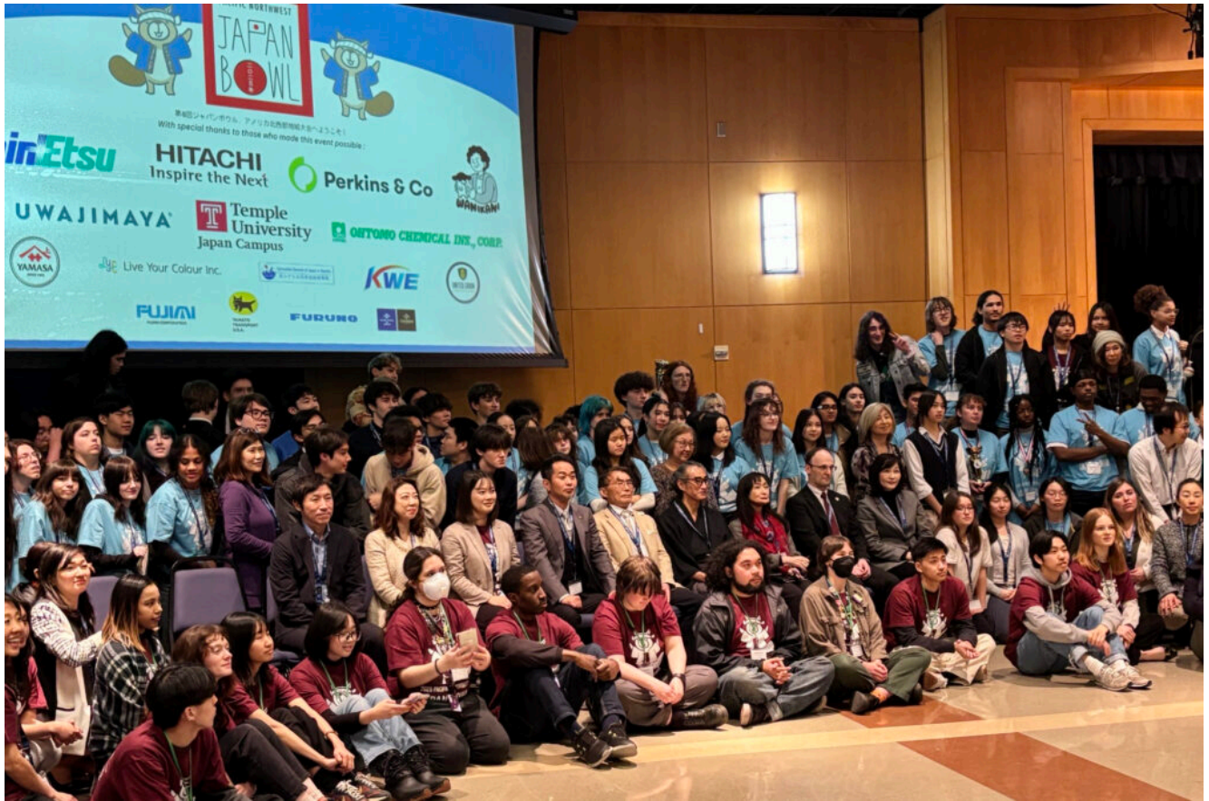
Organized by the Japan-America Society of Oregon (JASO), the event welcomed over 100 high school students from twelve schools across Oregon and Washington. This year was the largest Pacific Northwest Japan Bowl to date.