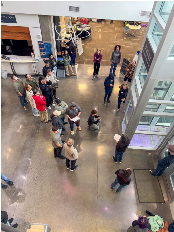
Students gather around the drop tower in the STEM building to watch the tests.

“Doors closing,” announced a student with a clipboard. The countdown began: “5