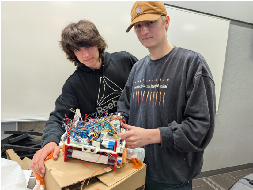
Team The Unnamed protected their robot rover from the fall with thick padding inside a cardboard box.

Most teams designed a parachute to slow the fall. If the vehicle survived the drop, its mission was to pick up as many gumballs as possible (simulating moon rocks) and cross the finish line—without human intervention.