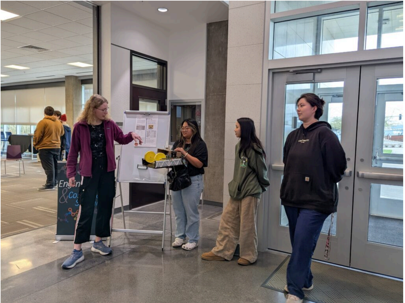
Team PAALM presents their robotic rover design before testing it.

Throughout the morning, all 18 teams presented their designs and then climbed the stairs to test their projects in the drop tower. After testing their autonomous vehicle, students examined what worked, what didn't, and how they would improve it.