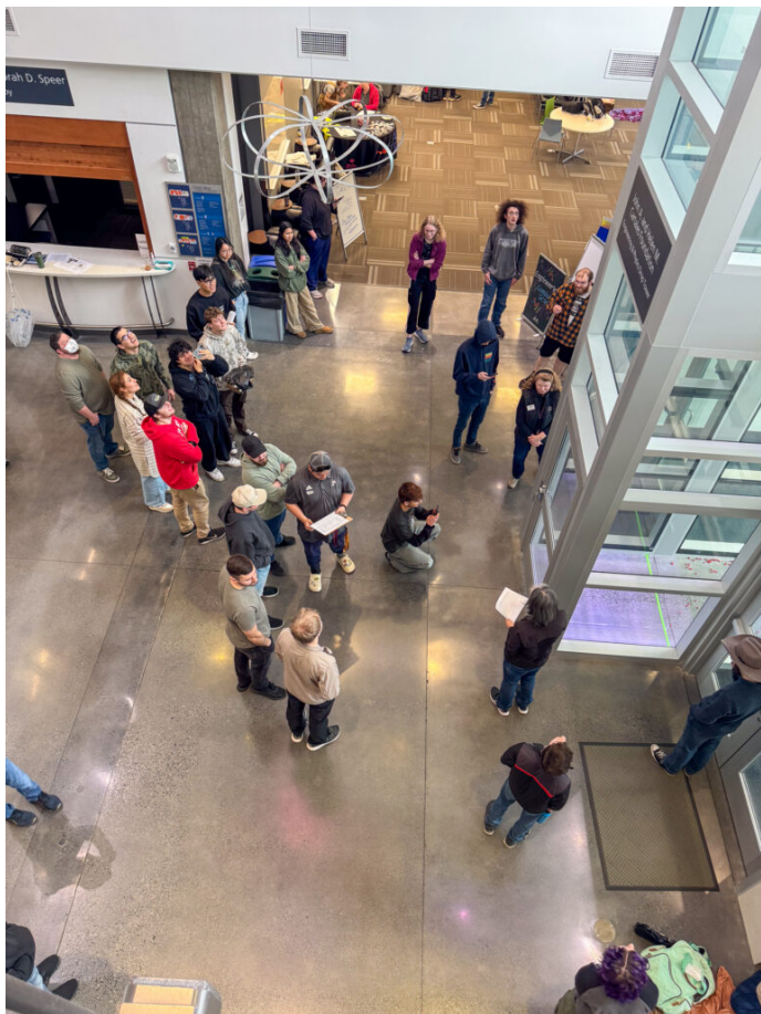
Students gather around the drop tower in the STEM building to watch the tests.

“Doors closing,” announced a student with a clipboard. The countdown began: “5