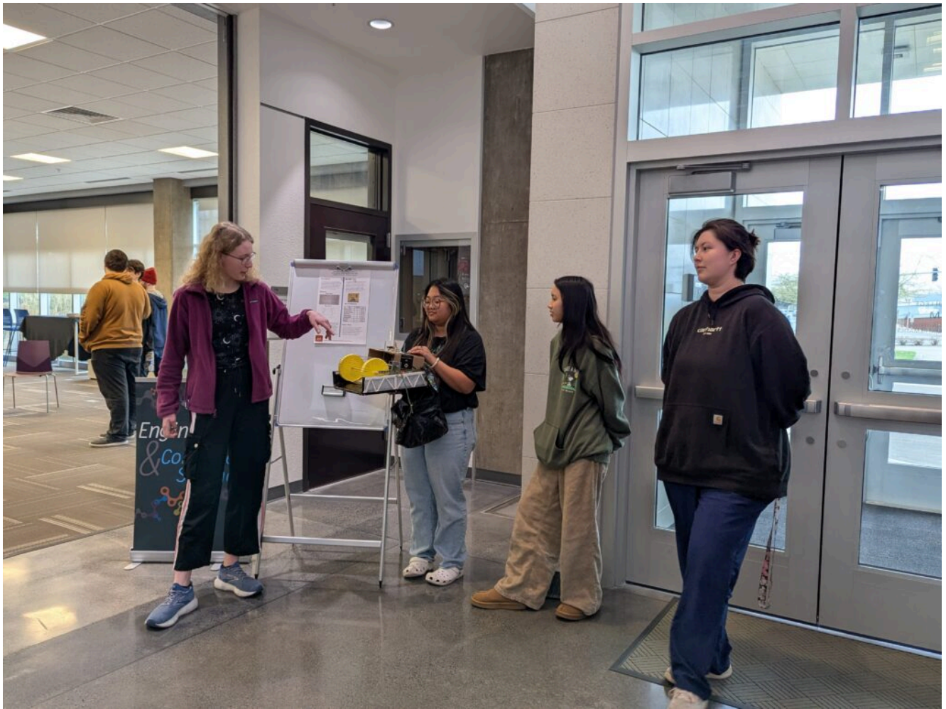
Team PAALM presents their robotic rover design before testing it.

Throughout the morning, all 18 teams presented their designs and then climbed the stairs to test their projects in the drop tower. After testing their autonomous vehicle, students examined what worked, what didn't, and how they would improve it.