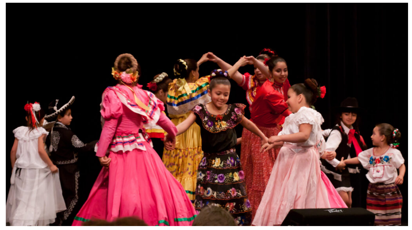
Young dancers perform with the Vancouver Ballet Folklórico at the 2012 celebration.

Clark College invites the community to enjoy two vibrant, family-friendly Latiné cultural events on campus this April. Día del Niño (Day of the Child) will be held on Friday, April 25 , and Noche de Familia (Family Night) follows on Tuesday, April 29 . Both events take place at the Gaiser Student Center on the college's main campus at 1933 Fort Vancouver Way. Admission is free, and all are welcome.