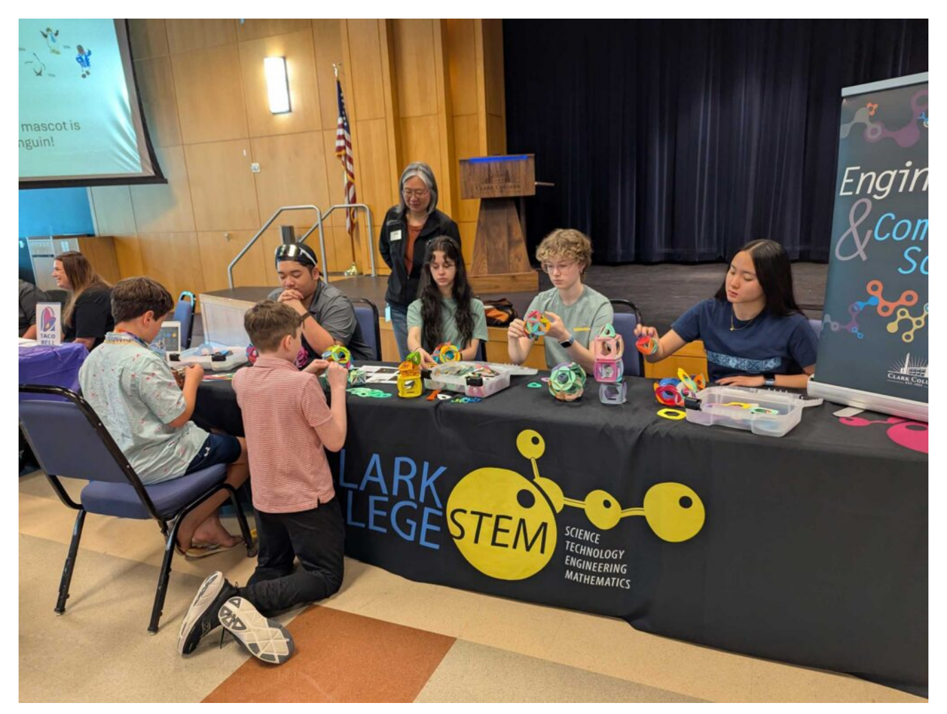
The STEM Engineering table was busy with older kids building platonic solids 3D shapes.