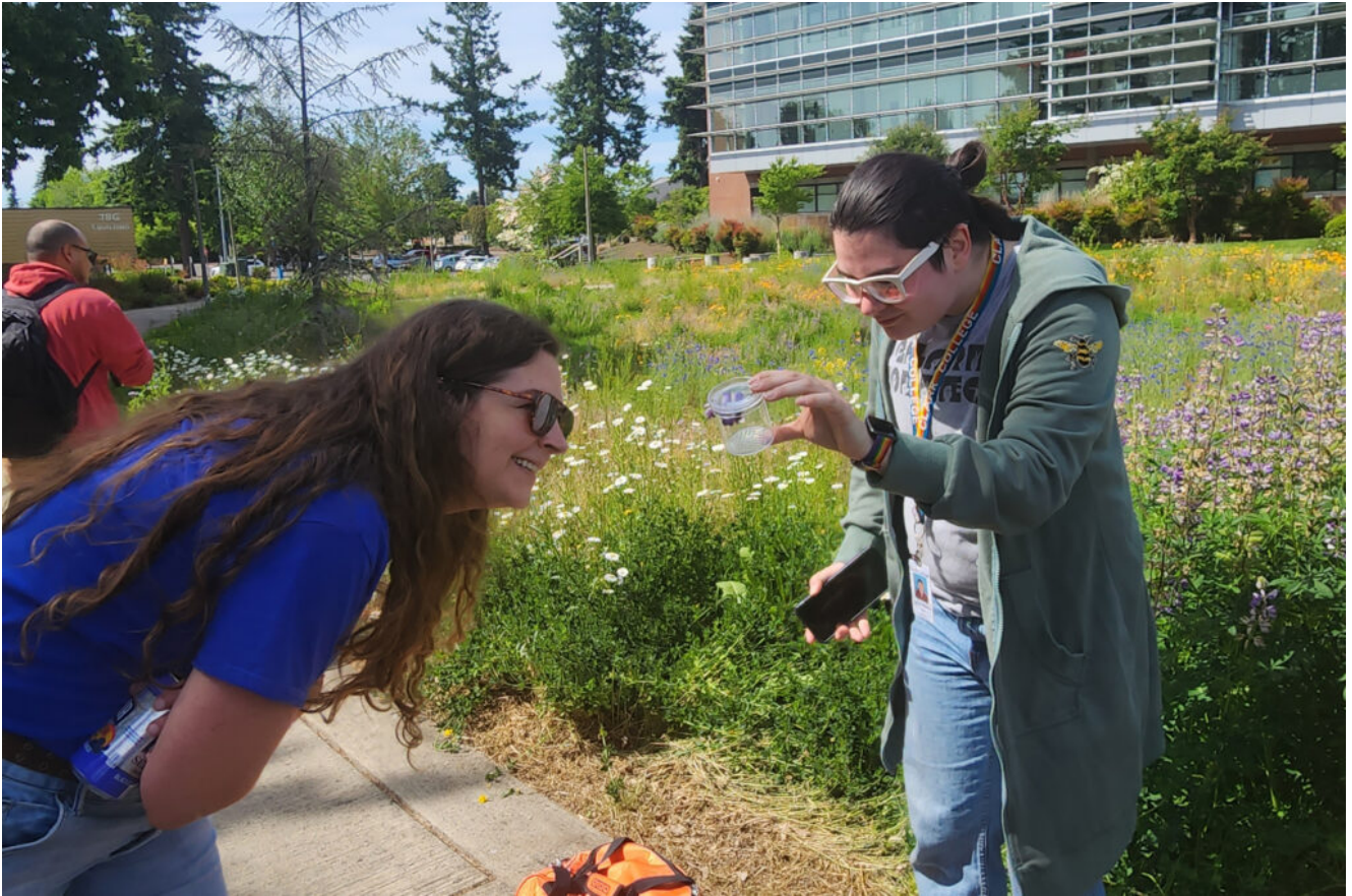
Participants in the Bee Campus Talk & Tour have a chance to view the bees up close.