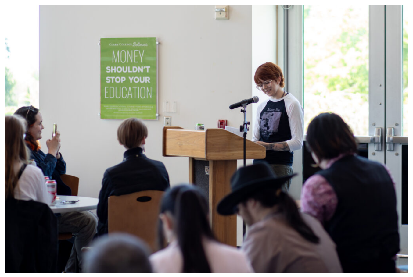
The 2024 release of The Swift, a student-run literary journal, included readings by authors featured in the publication.

Whether you're a seasoned writer or just love the written word, Clark College invites you to find inspiration, connection, and creativity at its annual Creative Writing Festival, taking place May 27–31. Free and open to the public, this week-long festival includes engaging readings, conversations, and workshops led by acclaimed authors—all designed to spark your imagination and grow your craft.