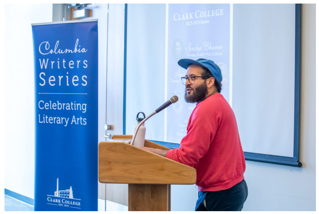
The Columbia Writers Series brings acclaimed writers to Clark College three times a year.