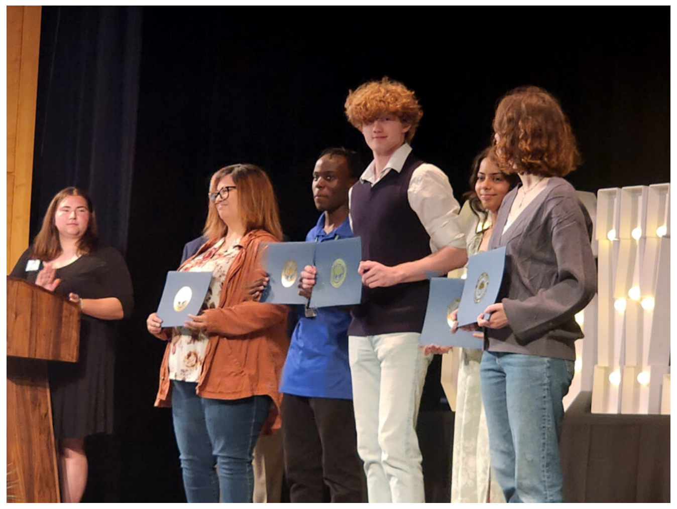
Students were awarded academic, employee, department, and ASCC program awards.

This year's OSWALD Awards Ceremony was a Penguin star-studded event with over 100 students being recognized for their outstanding achievements. As guests arrived, they had the opportunity to pose in front of the camera with props for fun photo-ops and fill their plates with delectable refreshments.