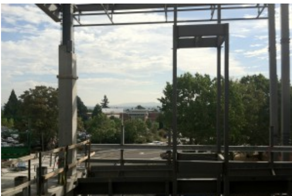
View of Gaiser Hall from the

The parking lots were filled. The Bookstore was bustling. And the sunshine poured down as if to comfort those who were still mourning the end of their summers as they started the 2015 fall quarter at Clark College on Monday, September 21.