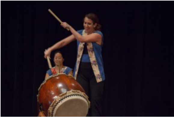
Members of Portland Taiko Drum perform during the 2015 Sakura Festival.