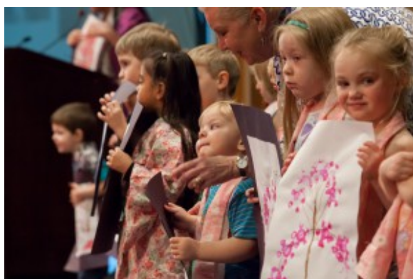
Children from Clark’s Child & Family Studies program show off their sakura-themed artwork during the 2015 Sakura Festival.