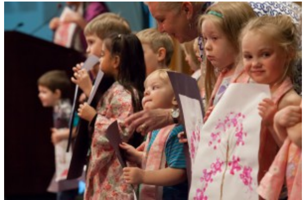
Children from Clark’s Child & Family Studies program show off their sakura-themed artwork during the 2015 Sakura Festival.