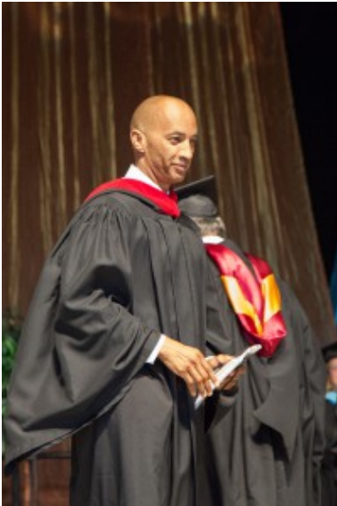
2014 commencement keynote speaker Byron Pitts

Pitts said that while some of that night's graduating class may have had an easy time earning their degrees, he suspected many had had rough roads to travel. "I imagine there are some graduates here tonight who heard too often, 'Not you, now now, not yet. You're not good enough. You're not ready,'" he said, adding that he called such graduates "Children of the Storm."