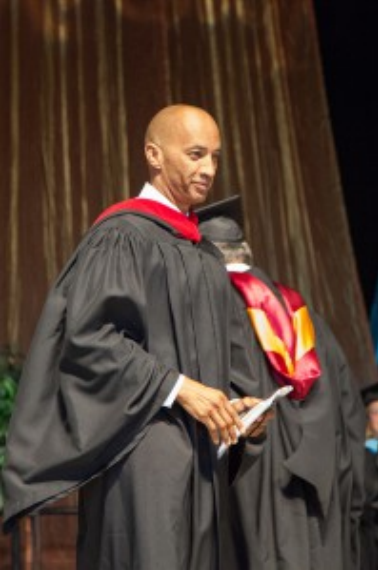
2014 commencement keynote speaker Byron Pitts

Pitts said that while some of that night's graduating class may have had an easy time earning their degrees, he suspected many had had rough roads to travel. "I imagine there are some graduates here tonight who heard too often, 'Not you, now now, not yet. You're not good enough. You're not ready,'" he said, adding that he called such graduates "Children of the Storm."