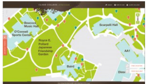
The online map documents Clark's extensive arboretum.