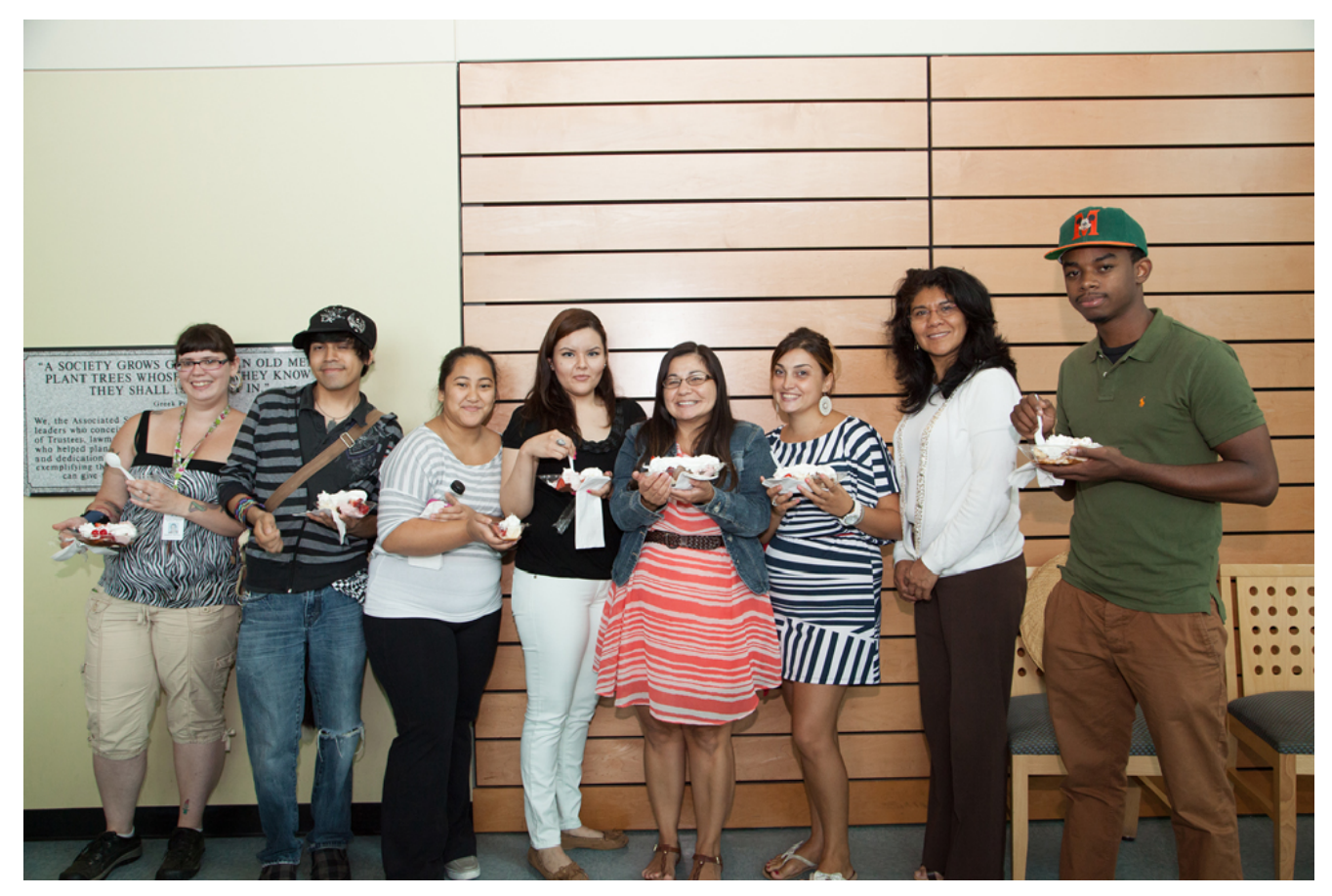
Staff from the Diversity Center enjoy their sundaes.