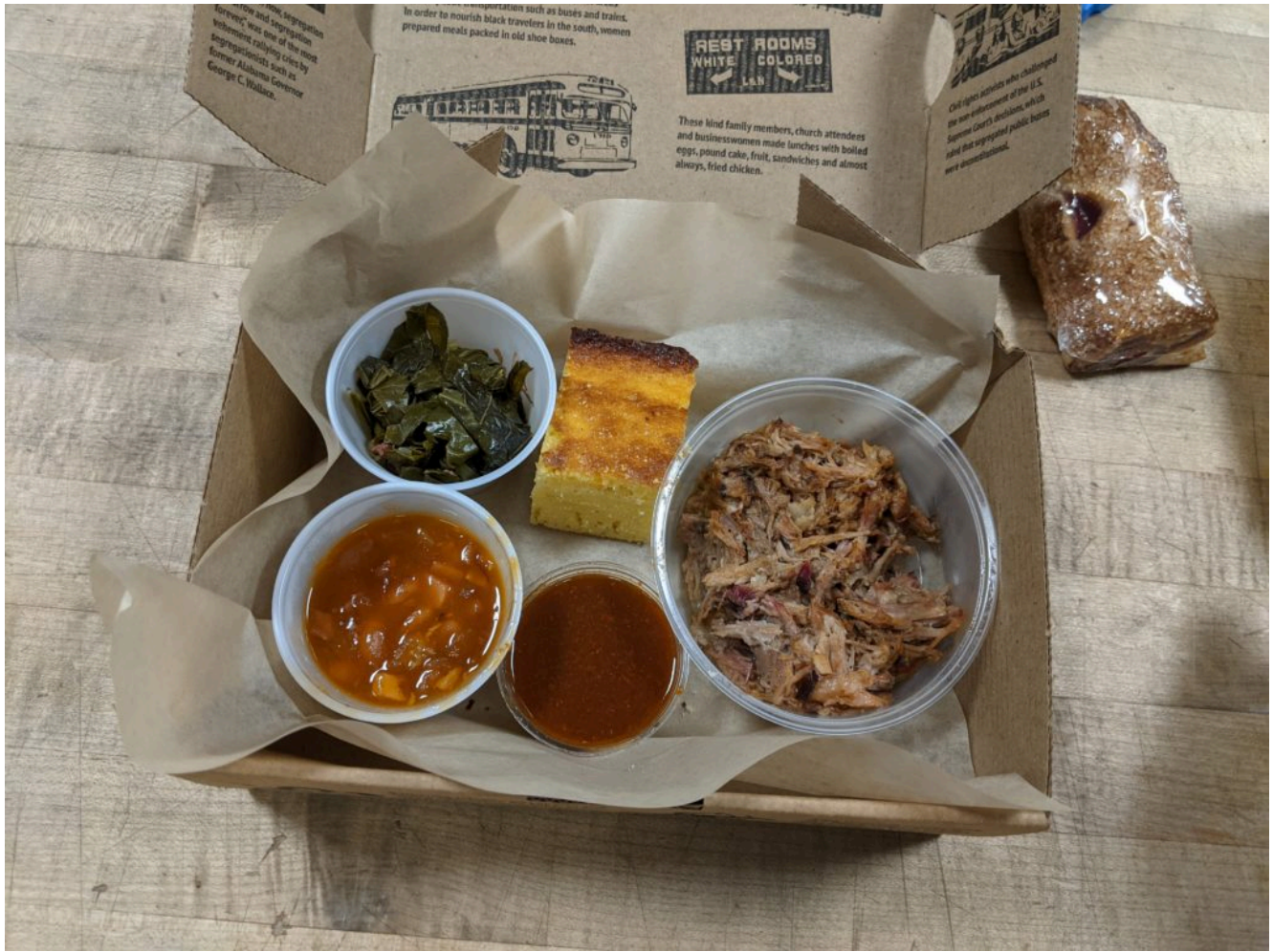
Each Juneteenth lunch was packed in a box printed with information on Black history.

“My grandmother told me that barbecue is something that Blacks and whites in the South share,” he said. “When tobacco was harvested in the fall, it was all-hands-on-deck with Blacks and whites working together doing the harvest.”