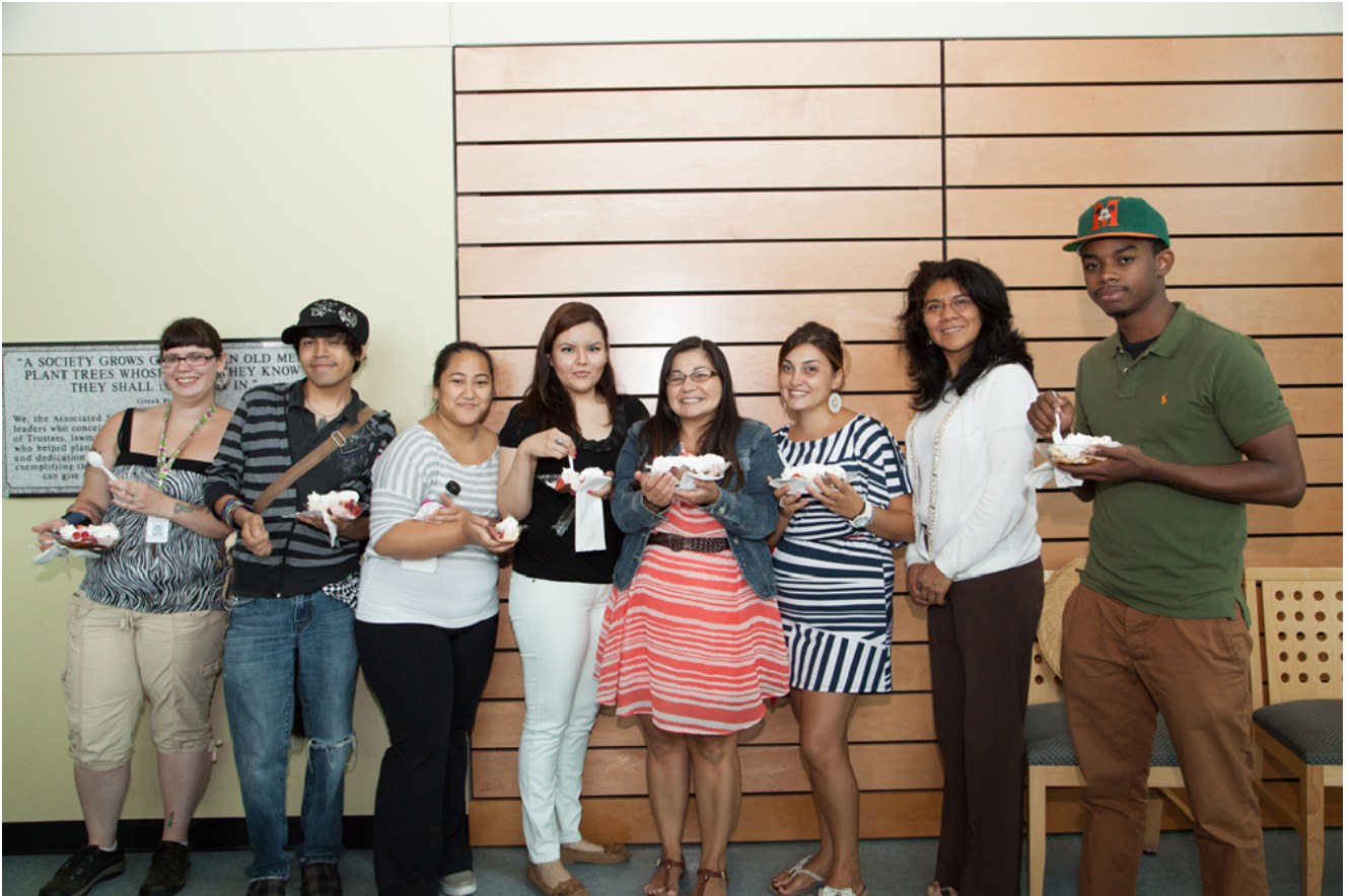
Staff from the Diversity Center enjoy their sundaes.