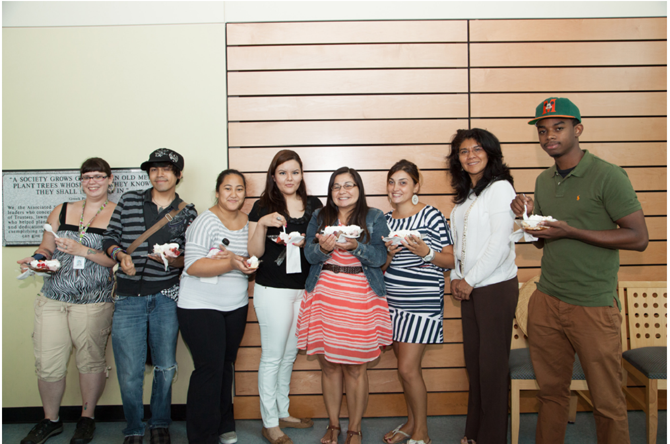
Staff from the Diversity Center enjoy their sundaes.