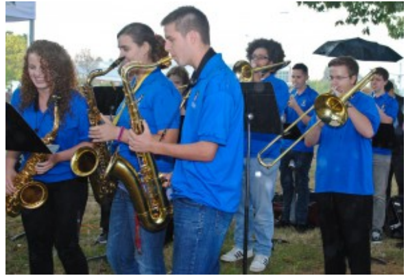
Clark College's pep band played through the rain during the STEM Building groundbreaking.

"I have learned how things function in the world outside of the classroom," she said. "And though not all of the lessons have been enjoyable, Clark College's STEM program has provided me a safe learning environment that has helped me to learn in spite of my mistakes."