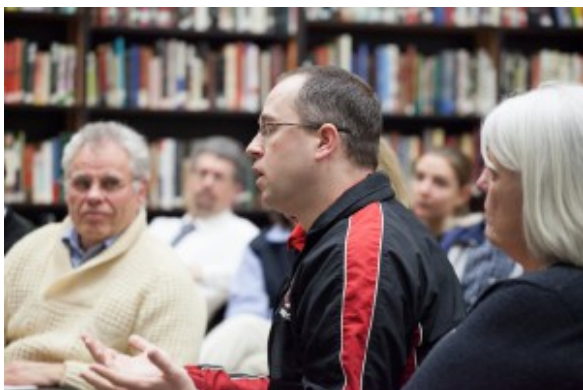
Columbia High School