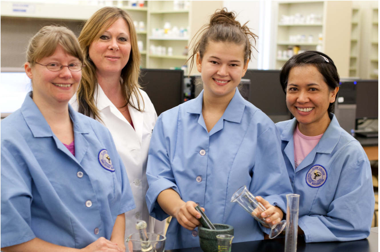
Pharmacy Technician students in the Columbia Credit Union Simulation Pharmacy

Clark College's Pharmacy Technician program has been ranked No. 1 in the nation by Washington Monthly in its annual "College Rankings" issue.