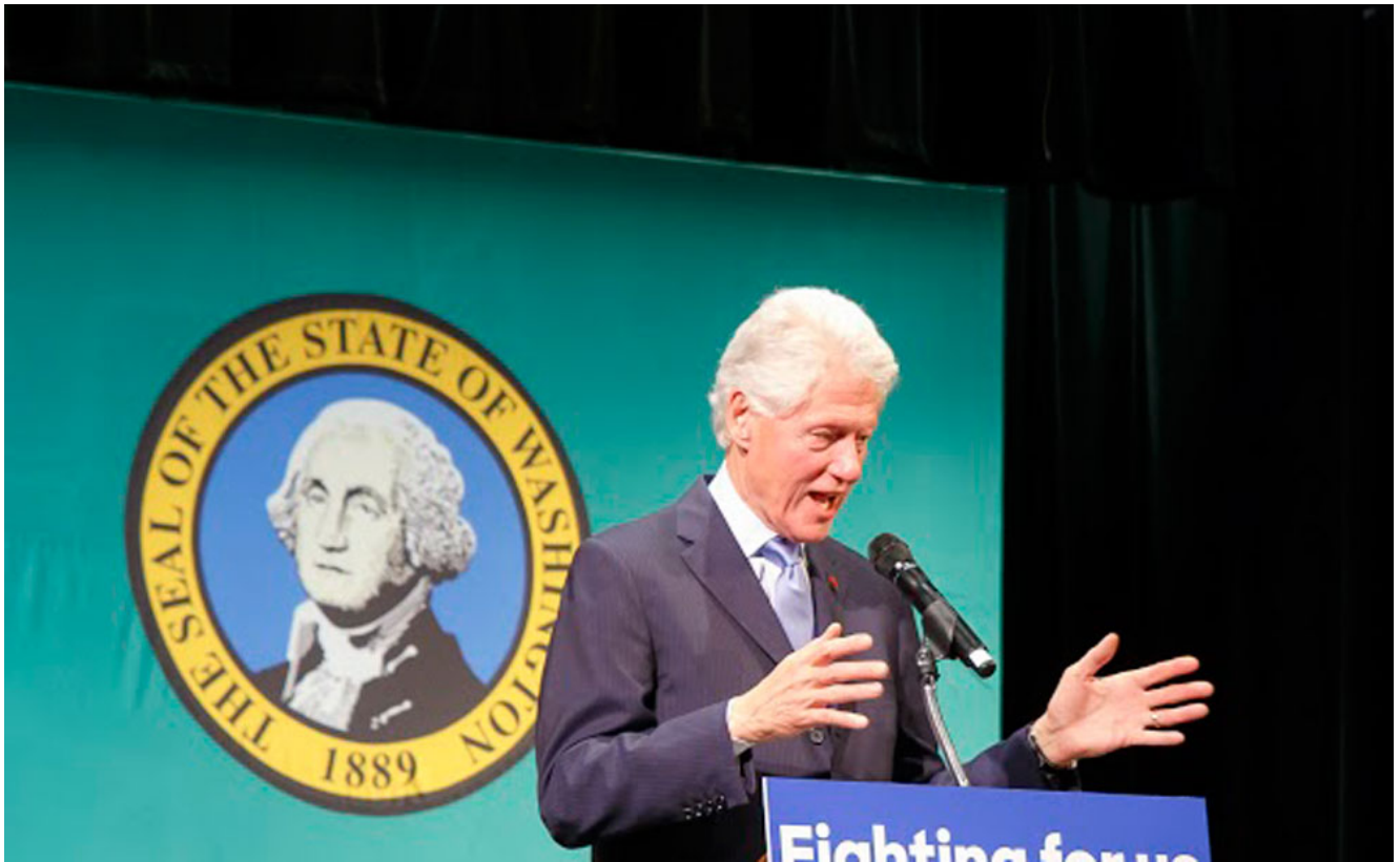
Former President Bill Clinton speaking at Clark College.

Normally, the first day of spring break on Clark College's main campus feels like the calm after the storm. The parking lots are empty, faculty and students are home recovering from finals, and some offices are closed or on reduced hours. But on March 21, the campus swirled with activity after the Sunday announcement that former U.S. President Bill Clinton would be speaking in Gaiser Student Center that Monday evening.