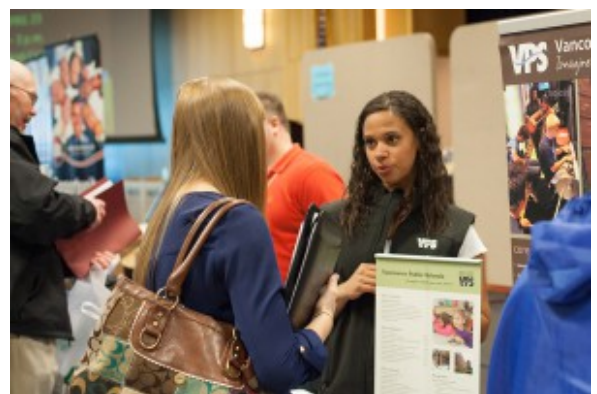
Visitors at the 2014 Career Days job fair had a chance