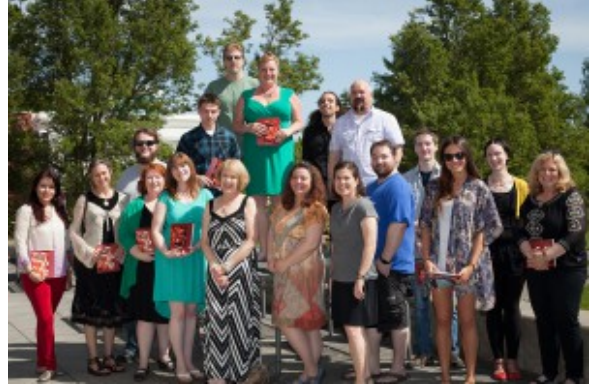
The 2014 Phoenix staff.

Erin Merrill, "Columbia River Series", photography Excellence in Photography Award Sponsored by Pro Photo Supply