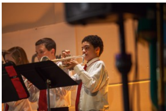
Aspire Middle School participates in the Jazz Festival.