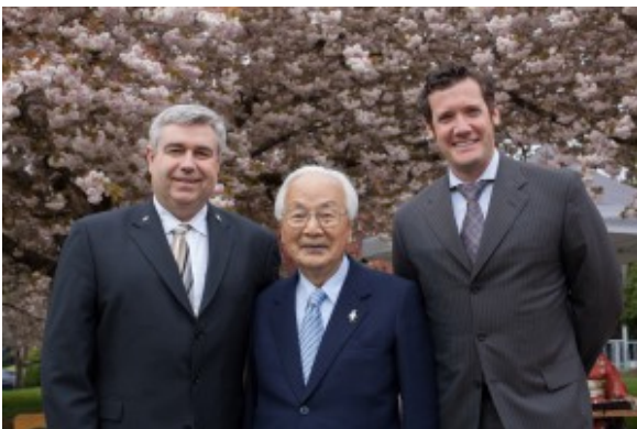
Clark College President