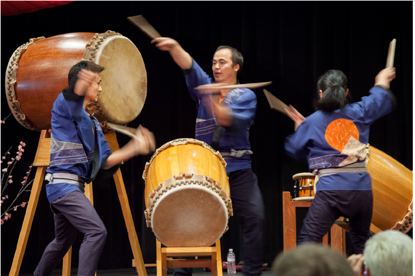
Portland Taiko drummers perform.