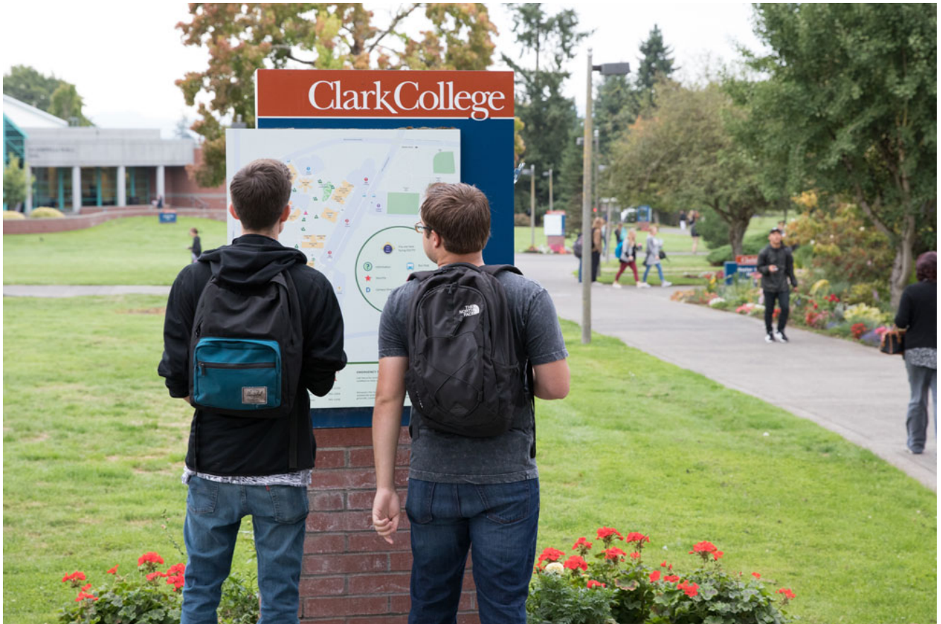
Students will be able to return to campus beginning in fall term.

Last week Clark College published its 2021 fall class schedule, which includes more than 500 classes with on-campus components. This is a major step by the college—which has been in remote operations since March 2020—to safely return to campus this fall.