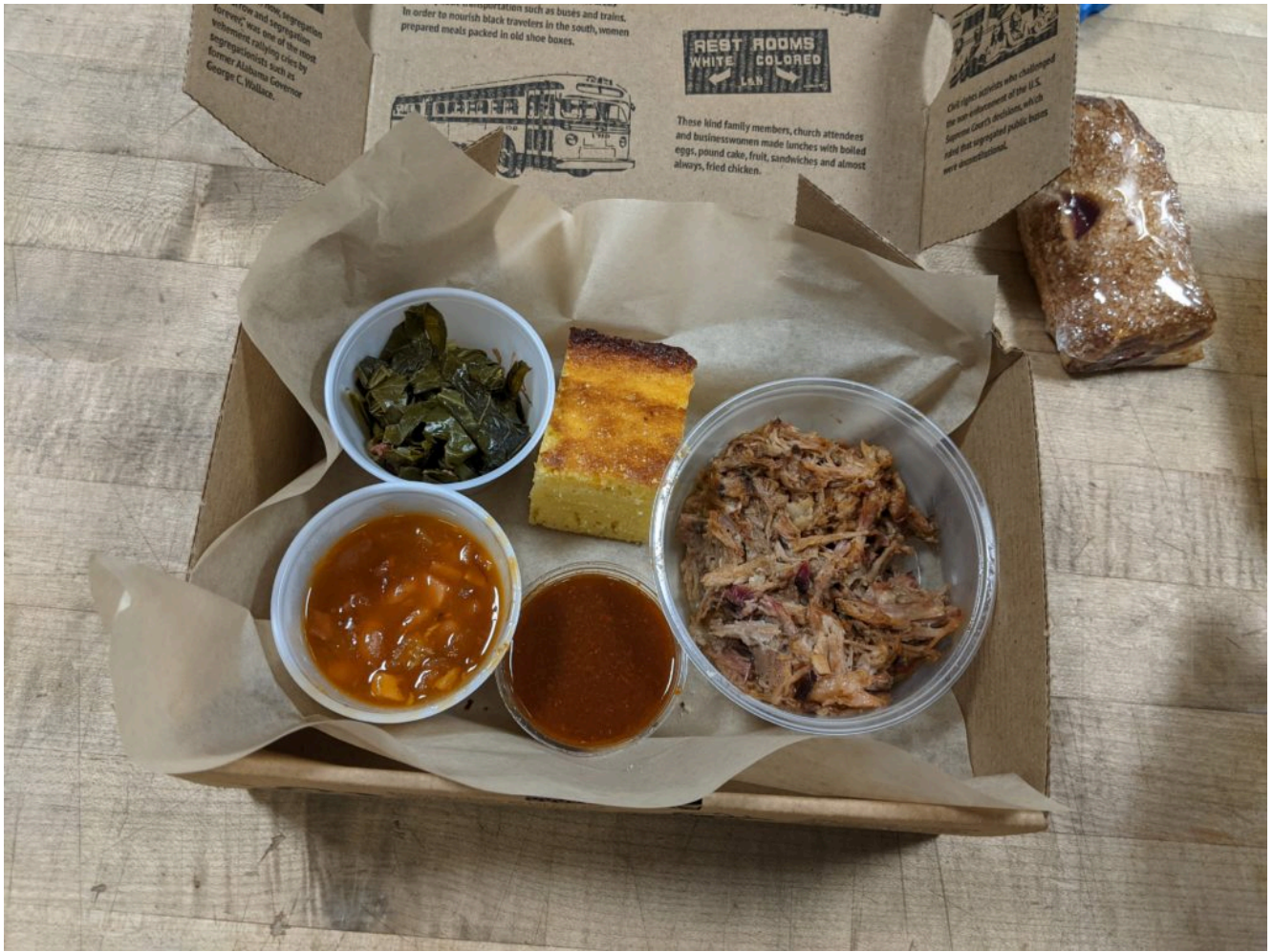
Each Juneteenth lunch was packed in a box printed with information on Black history.

“My grandmother told me that barbecue is something that Blacks and whites in the South share,” he said. “When tobacco was harvested in the fall, it was all-hands-on-deck with Blacks and whites working together doing the harvest.”