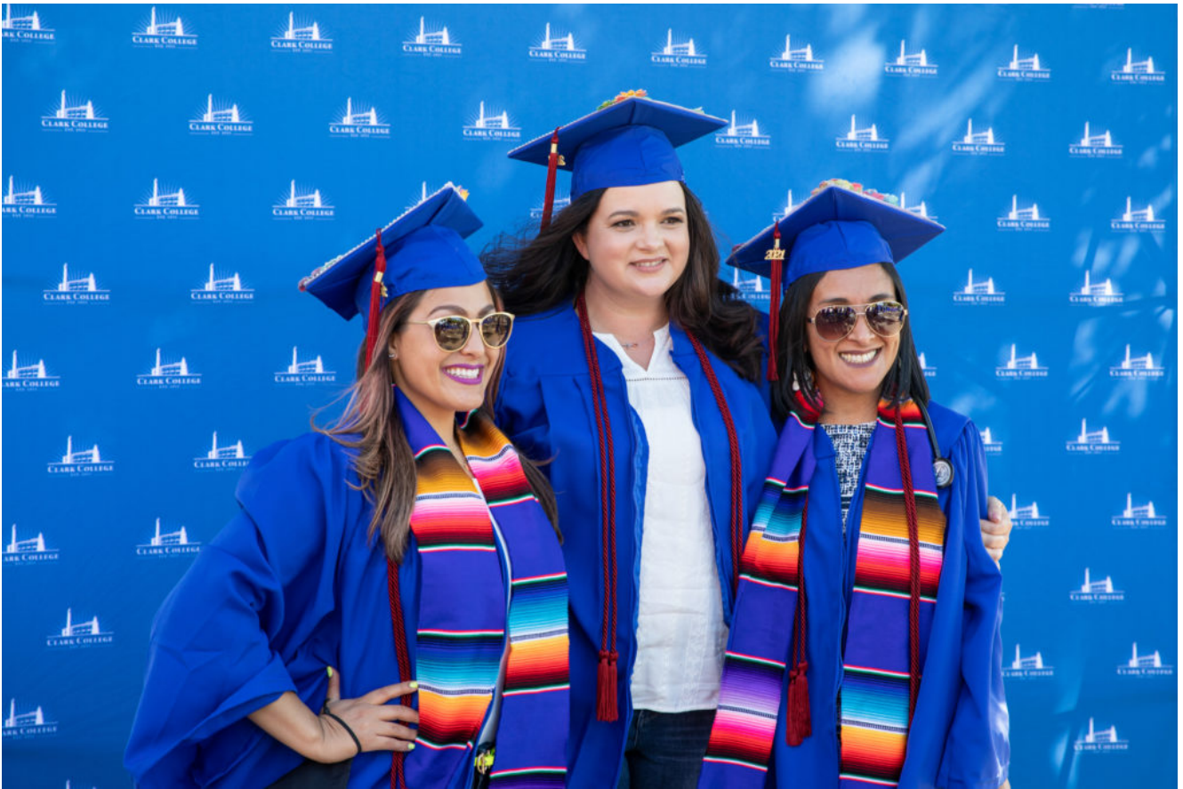
Three nursing graduates pose for a photo at the 2021 Commencement ceremony.