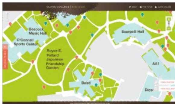
The online map documents Clark’s extensive arboretum.

The mobile-friendly online map is the product of work done by students in instructor Gus Torres’s spring 2013 Web Design II class. The students worked with the college’s Campus Tree Advisory Committee to identify trees in the campus’s extensive arboretum, which includes such notable trees as a six-decade-old Scarlet Oak and 100 Shirofugen blossoming cherry trees donated to the campus by Japanese businessman John Kageyama in 1990. Students then GPS-tagged each listed tree and added it to the map with information about its genus and species. Additional students contributed to the project in subsequent quarters. Hughes was one of the faculty members who helped support the project, along with Torres, Computer Graphics Technology professor Kristl Plinz, and Computer Technology instructor Bruce Elgort.