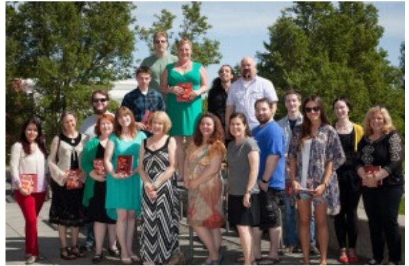
The 2014 Phoenix staff.

Erin Merrill, "Columbia River Series", photography Excellence in Photography Award Sponsored by Pro Photo Supply