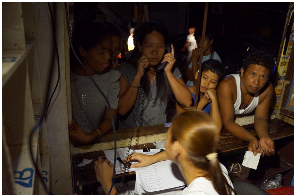
Guiuan residents line up to use the phone.

Looking from the small window of the Australian Air Force C-130 airplane one week after Super Typhoon Haiyan, the community of Guiuan looked like it had been bombed. Houses were flattened; trees were uprooted or snapped in half. Once I was on the ground, I could also see that all the vehicles were damaged and that the people were wet and dirty. Locals told me that some people had resorted to eating dogs for food, while others had looted stores for food or items to trade for food. Survivors created shelters from scraps of wood or tin. Others used tarpaulins or plastic bags. During the nights, the wind would blow so hard that the rain went sideways. It was impossible to stay dry, and the combination of wetness, hunger, and thirst made it close to impossible to sleep.