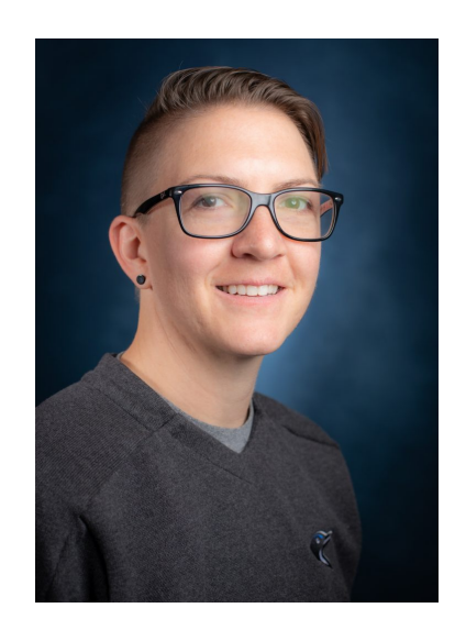
Clark College recently announced