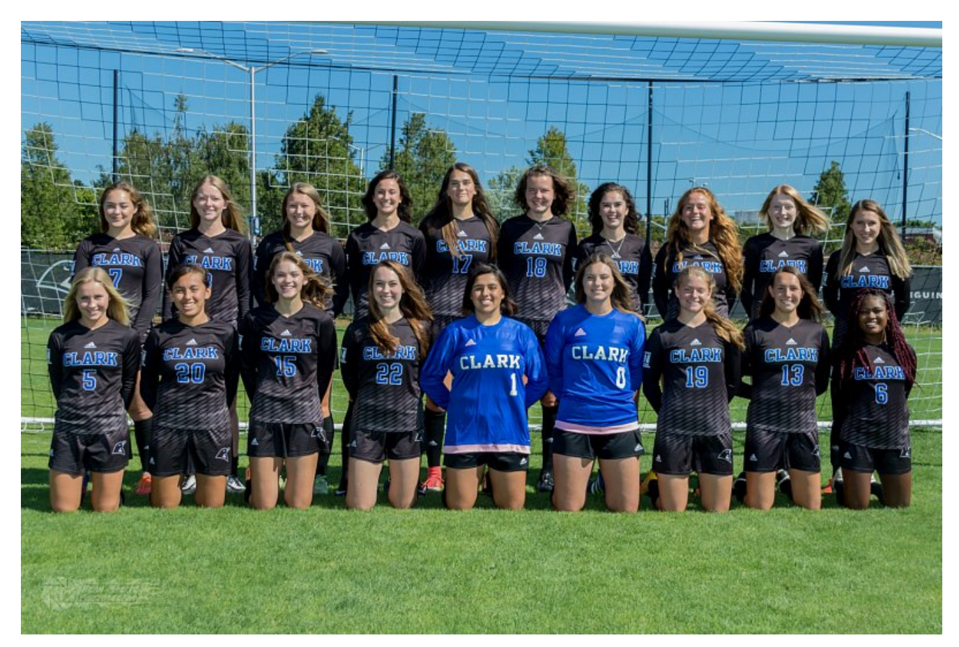
The 2017 Clark College Women's Soccer team

With its 2-0 road victory over Southwestern Oregon this past Saturday, Clark College Women's Soccer clinched the Northwest Athletic Conference (NWAC) South Region title.