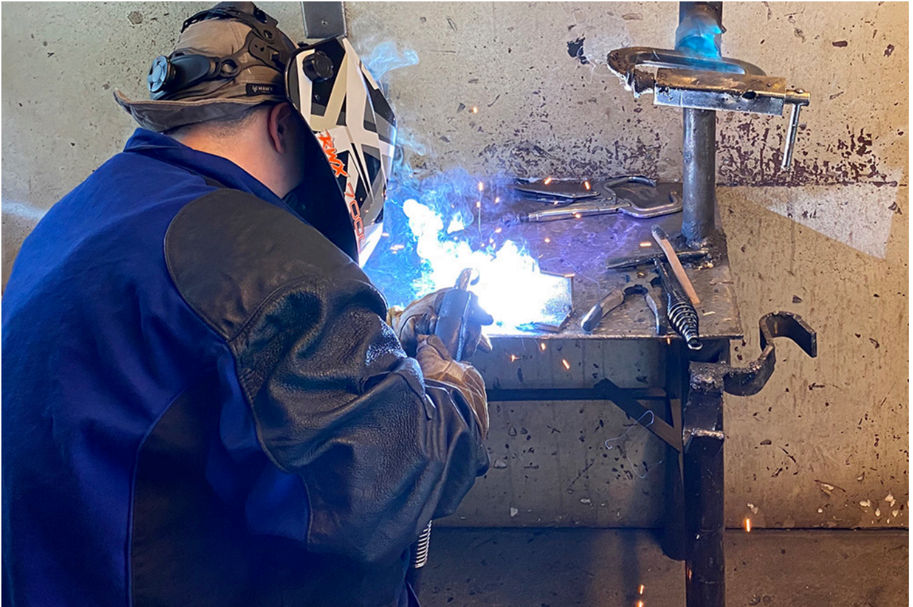
A Welding Technologies student participates in an on-campus lab, even though most Clark College classes are being offered remotely during COVID-19. Fortunately, the program had already shifted to partially online classes before the pandemic hit, and students wear personal protective equipment as part of basic welding safety.