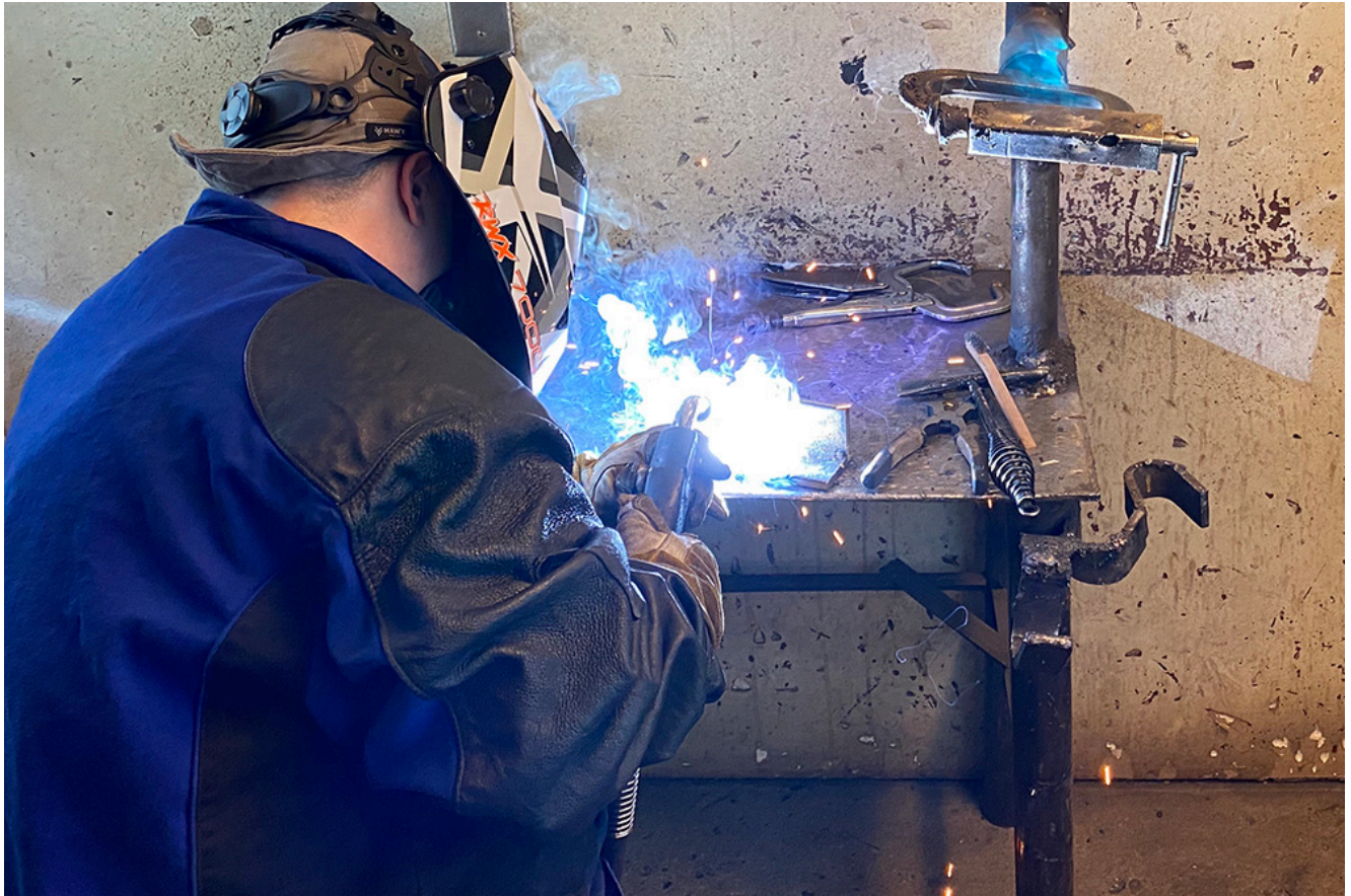
A Welding Technologies student participates in an on-campus lab, even though most Clark College classes are being offered remotely during COVID-19. Fortunately, the program had already shifted to partially online classes before the pandemic hit, and students wear personal protective equipment as part of basic welding safety.