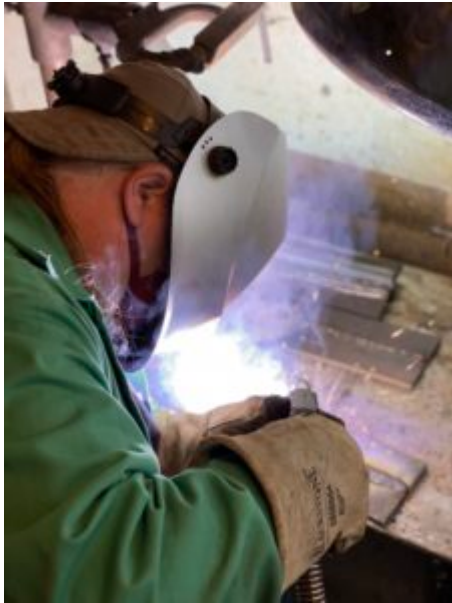
Even before the pandemic, welding students needed to suit up in personal protective equipment.

Because safety is paramount, students in the Welding 102 introductory class must pass a welding safety test with 100 percent. In the past, some students had to retake the test in order to pass. Hybrid learning increased students' understanding of the material and translated into a higher percentage of students who didn't have to take the test a second time.