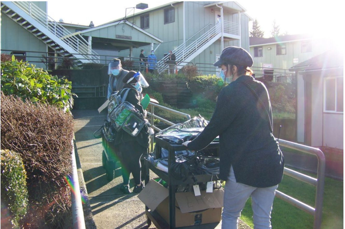
Clark College staff and faculty deliver backpacks full of school supplies to students at Larch Corrections Center, where online learning is not an option.