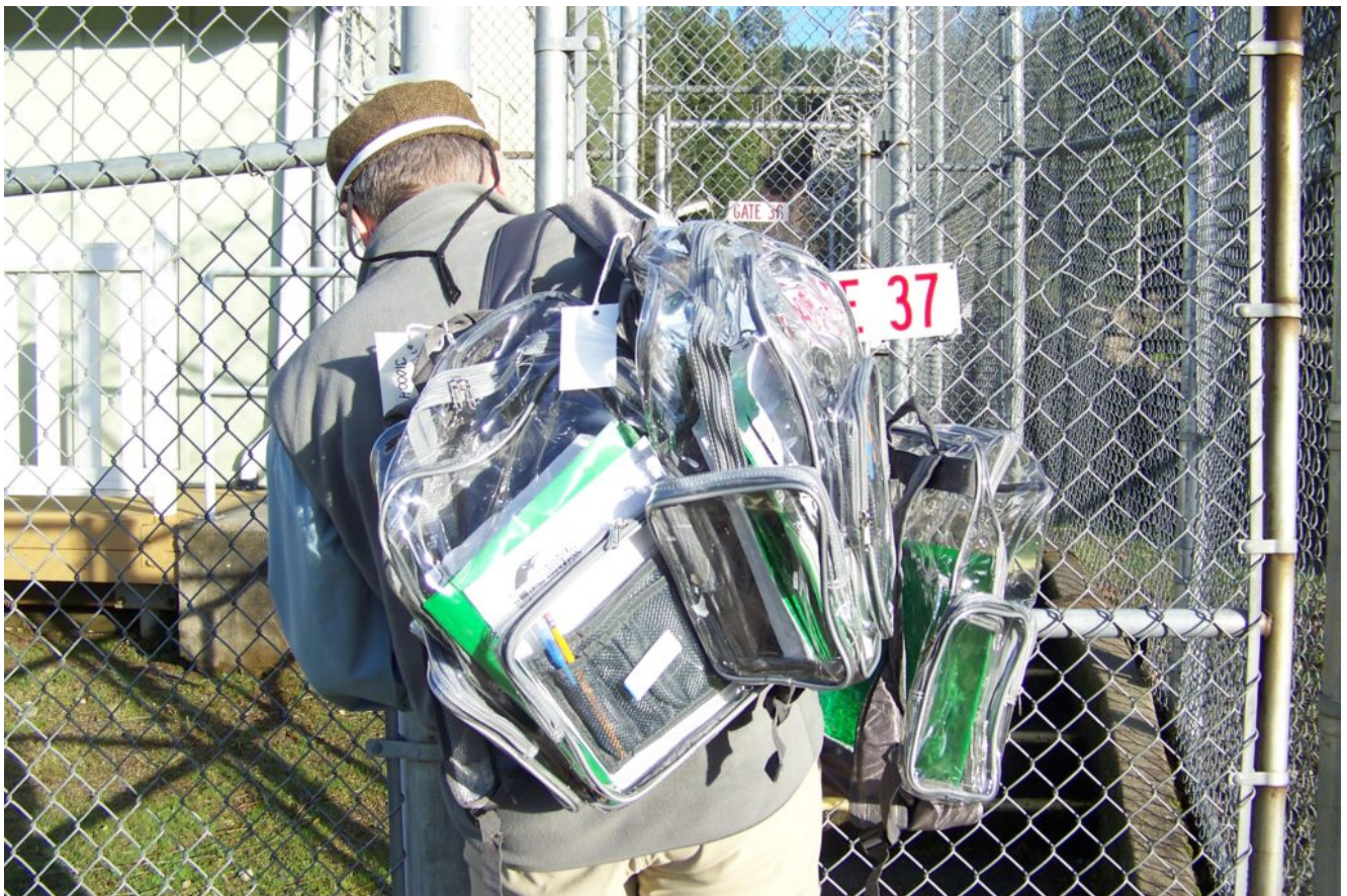
A Clark College faculty member brings backpacks full of class supplies to students at Larch Corrections Center.

A surge in COVID-19 cases paused Clark College’s programs at Larch Corrections Center in early January. The minimum-security prison had its first positive COVID-19 test in late December. Only a week later, 218 of those incarcerated –about 70 percent of the prison’s residency–had tested positive for COVID.