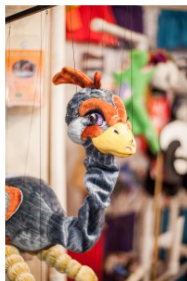
Jaco the Bird is the star of one of the bilingual