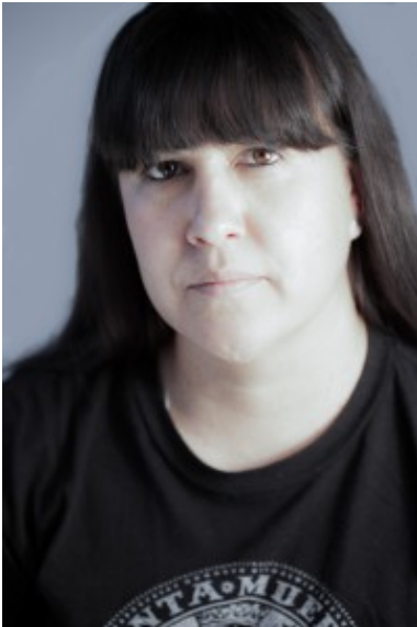
Natalie Diaz.

Angels don't come to the reservation. Bats, maybe, or owls, boxy mottled things. Coyotes, too. They all mean the same thing— death. And death eats angels, I guess, because I haven't seen an angel fly through this valley ever.