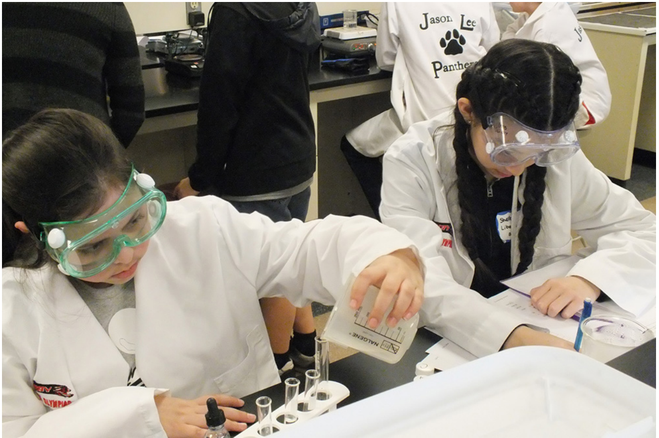
Students competing at the 2017 Southwest Washington Regional Science Olympiad.

Burning marshmallows, miniature hovercrafts, robotic arms, and the perennial favorite, bottle rockets, were a just a few of the 48 activities featured at this year's Southwest Regional Science Olympiad Tournament, which took place at Clark College on Saturday, March 4.