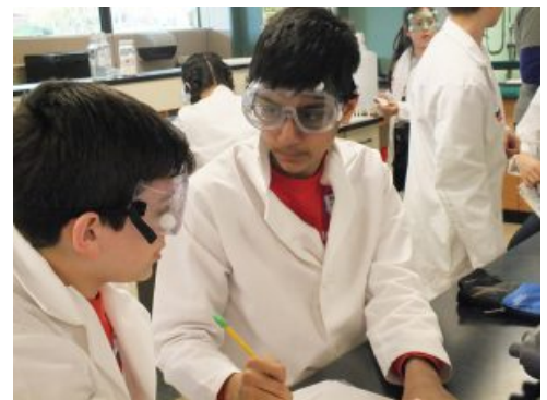
Mid-experiment at the Science Olympiad.

Burning marshmallows, miniature hovercrafts, robotic arms, and the perennial favorite, bottle rockets, were a just a few of the 48 activities featured at this year's Southwest Regional Science Olympiad Tournament, which took place at Clark College on Saturday, March 4.