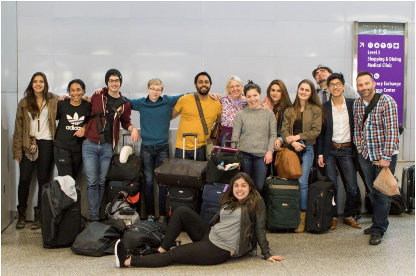
Staff from the 2017 Independent.

Clark College student journalists brought home first- and fourth-place honors from the annual Associated Collegiate Press' midwinter conference, held March 2-5 in San Francisco.