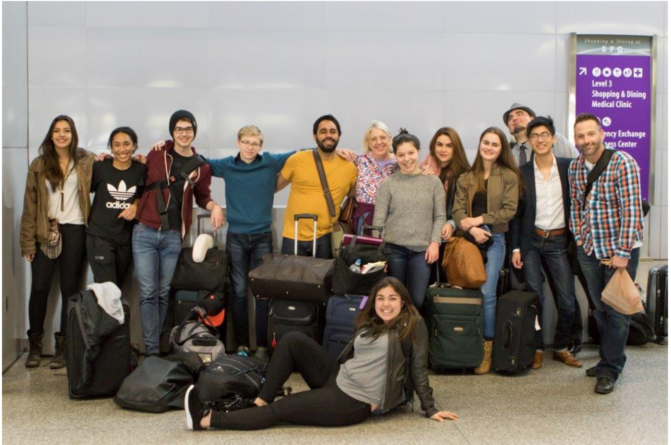
Staff from the 2017 Independent.

Clark College student journalists brought home first- and fourth-place honors from the annual Associated Collegiate Press' midwinter conference, held March 2-5 in San Francisco.