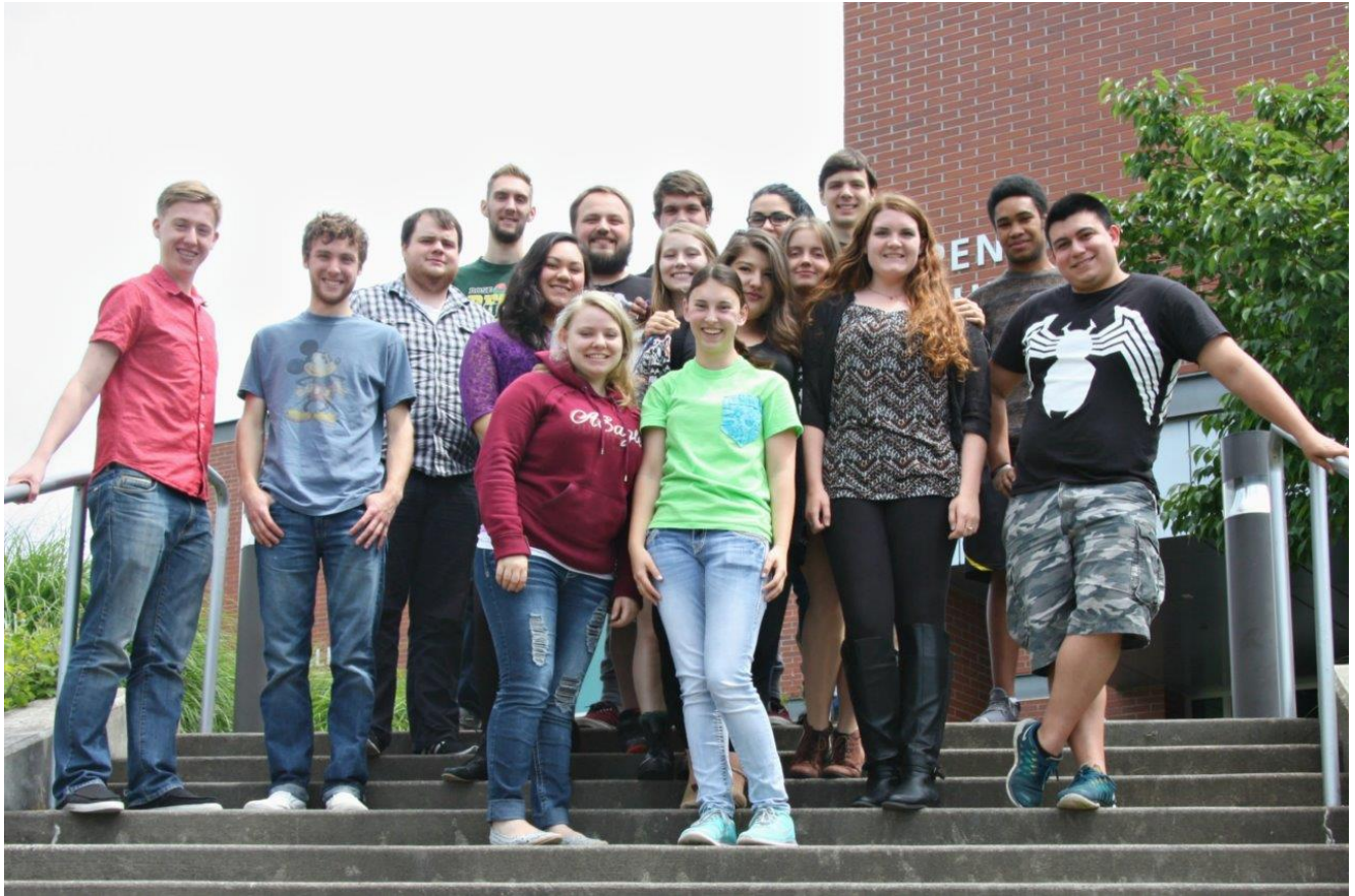
The spring 2015 staff of The Independent , Clark's student newspaper.

Clark College student journalists captured all three top awards in a competition for the best in news reporting, editing and production by teams at 13 community colleges in Oregon and Washington, according to results made public Sunday.