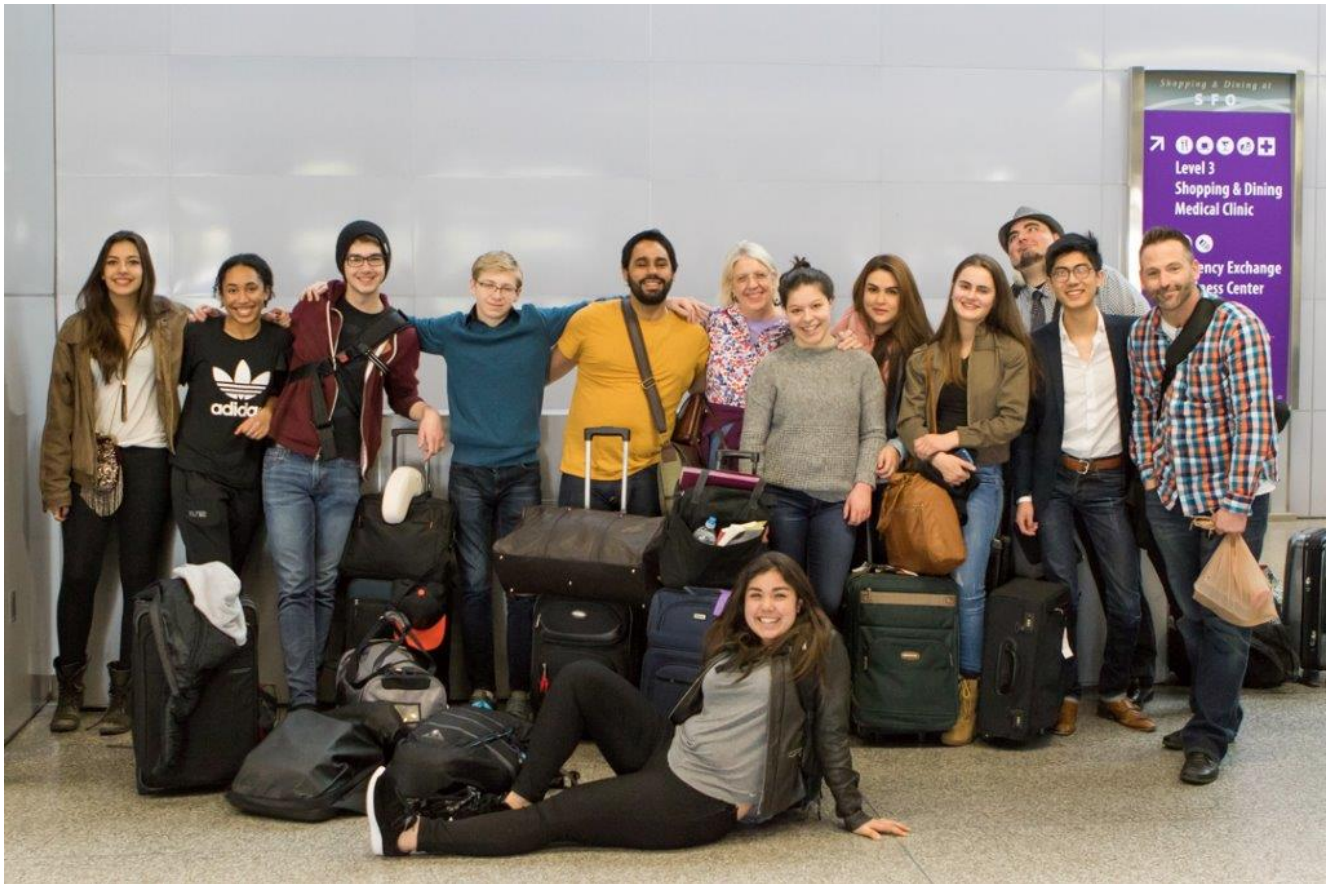
Staff from the 2017 Independent.

Clark College student journalists brought home first- and fourth-place honors from the annual Associated Collegiate Press' midwinter conference, held March 2-5 in San Francisco.