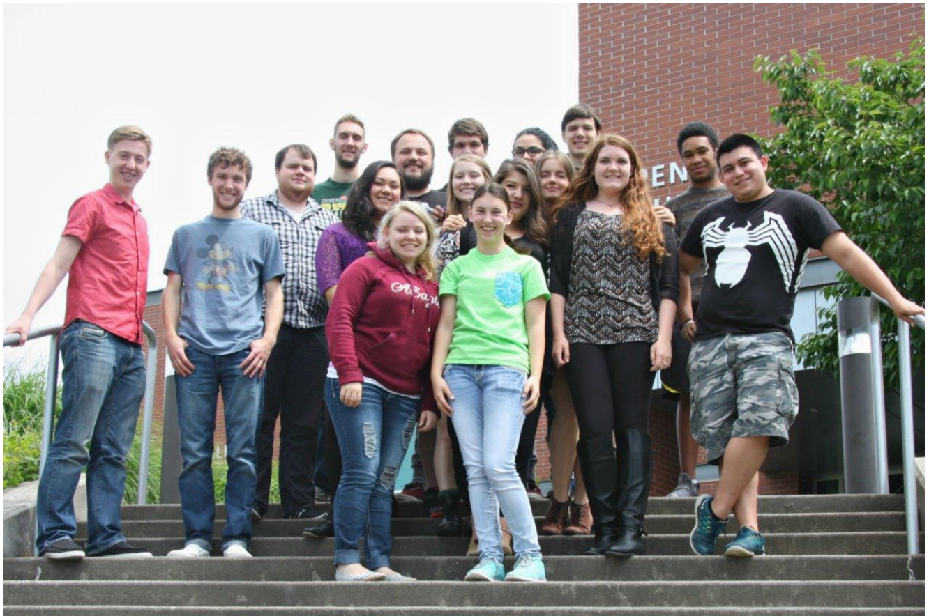
The spring 2015 staff of The Independent , Clark's student newspaper.

Clark College student journalists captured all three top awards in a competition for the best in news reporting, editing and production by teams at 13 community colleges in Oregon and Washington, according to results made public Sunday.