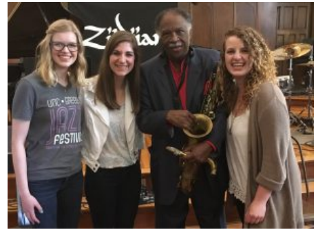
Members of the Clark Jazz Ensemble saxophone pose with iconic saxophonist Houston Person.