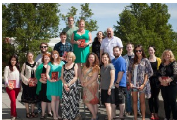
The 2014 Phoenix staff.

Erin Merrill, "Columbia River Series", photography