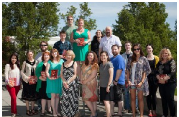
The 2014 Phoenix staff.

Erin Merrill, "Columbia River Series", photography