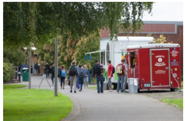
Food carts make their debut on campus.