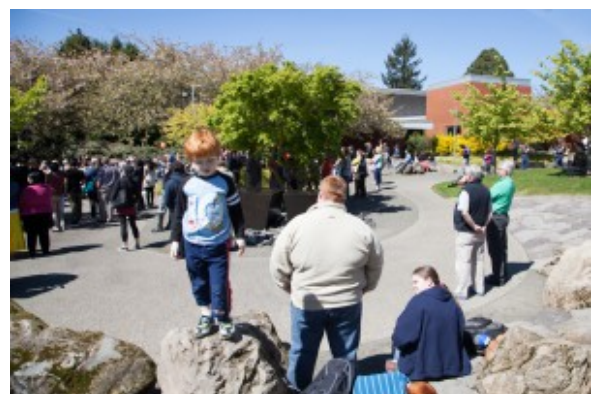
Korbin Hair, 5, stands atop a rock in the Japanese

This year's event marked not only the 25th anniversary of the trees' planting on Clark's campus, but also the 10th anniversary of the festival itself, which is held by the college in partnership with the City of Vancouver and the Vancouver Rotary Club.