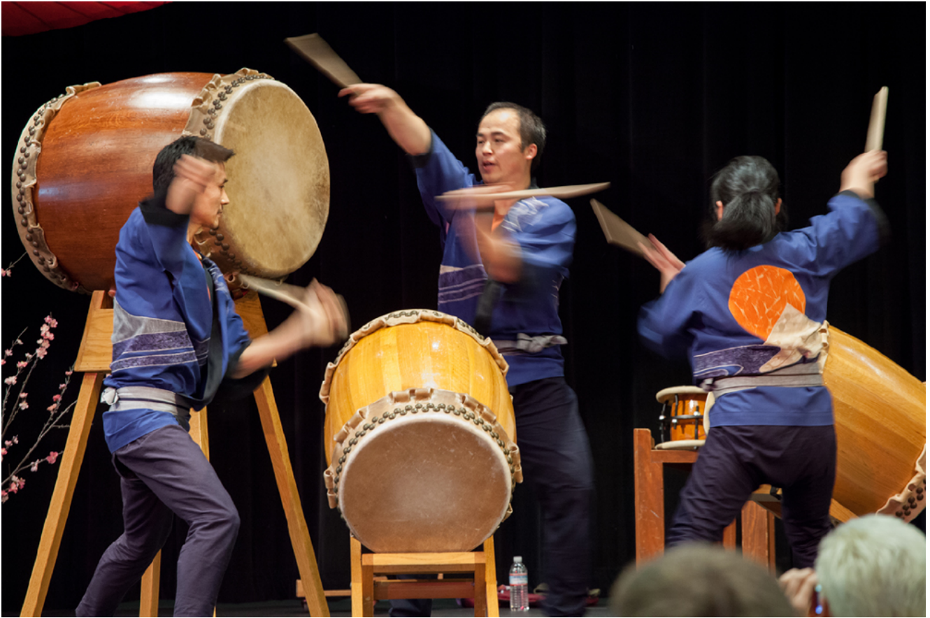
Portland Taiko drummers perform.