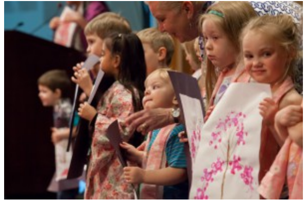
Children from Clark's Child & Family Studies program show off their sakura-themed artwork during the 2015 Sakura Festival.

Afterward, entertainment included a traditional dance performance by the Clark College Japanese Club, a drum performance by Portland Taiko, and a presentation of sakura-themed art by children from Clark's Child & Family Studies program. The family-friendly event included lots of free activities and cookies from the Clark College Bakery.