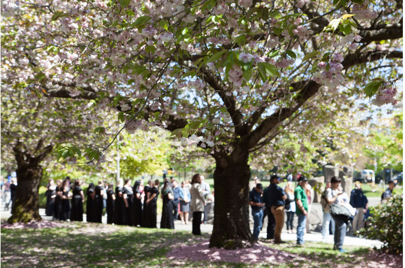
The Women's Ensemble gets ready to perform at the 2015 Clark College Sakura Festival.