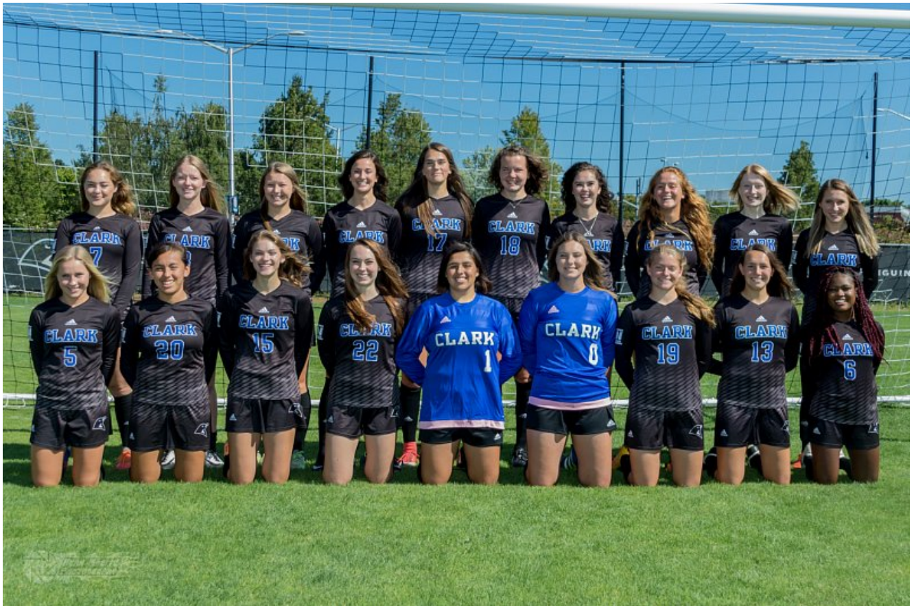
The 2017 Clark College Women's Soccer team

With its 2-0 road victory over Southwestern Oregon this past Saturday, Clark College Women's Soccer clinched the Northwest Athletic Conference (NWAC) South Region title.