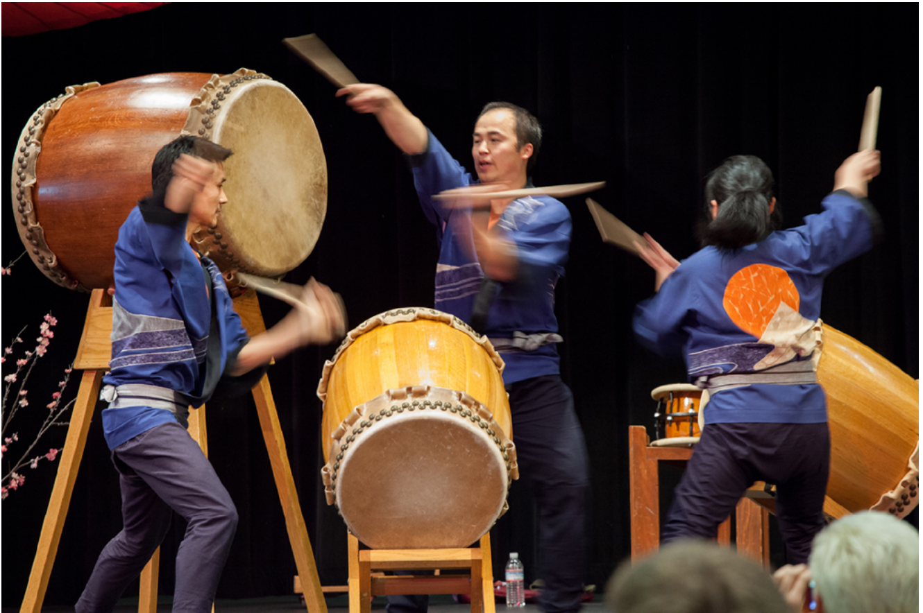
Portland Taiko drummers perform.