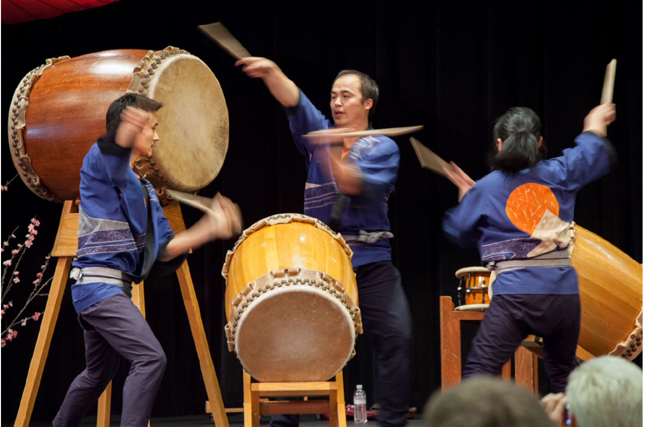
Portland Taiko drummers perform.