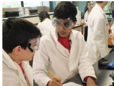
Mid-experiment at the Science Olympiad.

More than 350 young scientists from 20 middle-school and 18 high-school teams competed in the Olympiad, coming from as far north as La Push, Washington, and as far south as Corvallis, Oregon. Winning teams from the regional competition earned spots in the Washington State Science Olympiad, which will take place at Highline College in Des Moines, Washington, on April 15.